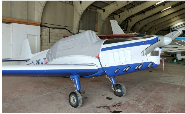
Zlin 326 Travel Cover