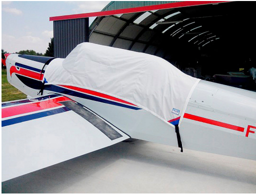
Zlin 526 Canopy Cover

the hottest of days. It is water, ice and snow repellent, yet breathable to allow moisture to escape from between the cover and the aircraft surface.