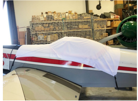
Zlin 526 Canopy Cover, test fit cover