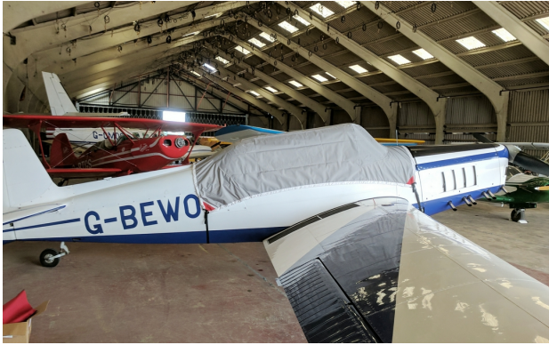
Zlin 326 Travel Cover

Travel Covers are made with Silver Solution-Dyed Polyester fabric and only lined over the windshield to save weight. The material is lightweight and more compact for easy stowage in the aircraft. The polyester material is water resistant, but only intended for occasional use outside. We also have an ultra lightweight material available for fitted hangar dust covers. For daily outdoor use, the non-travel Sunbrella Cover is the best choice.