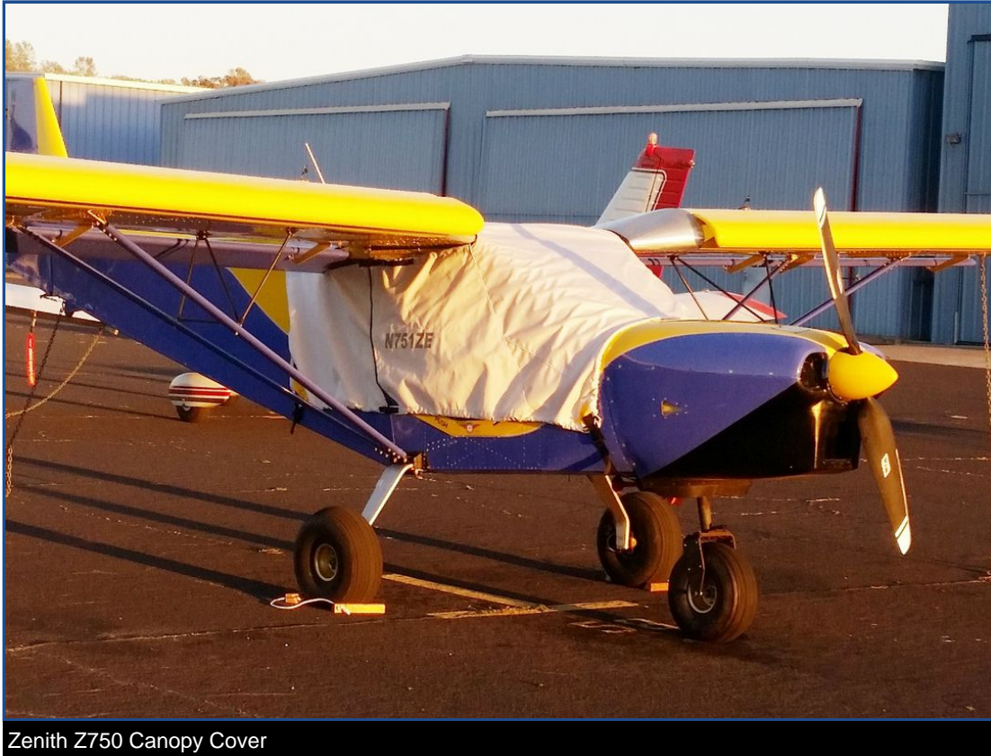
Zenith Z750 Canopy Cover