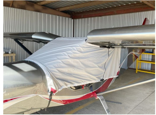
Zenair 750 Cruiser Travel Weight Extended Canopy Cover