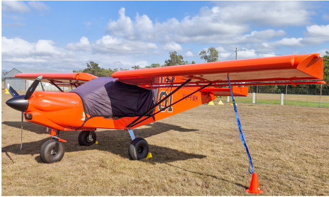
CH750 STOL Travel Cover, Light Weight Extended Canopy Cover

This cover type is made from Silver Acrylic Sunbrella canvas and is 100% lined with a soft and smooth microfiber. Bruce's Custom Covers developed this material combination especially for aircraft protection. The outer material is medium weight and treated for water resistance, UV resistance and anti-static buildup. The inner lining is a very soft and smooth microfiber to prevent scratching. The material is very reflective, and tests show that the cabin interior temperature can be reduced to near-ambient temperature on the hottest of days. It is water, ice and snow repellent, yet breathable to allow moisture to escape from between the cover and the aircraft surface.