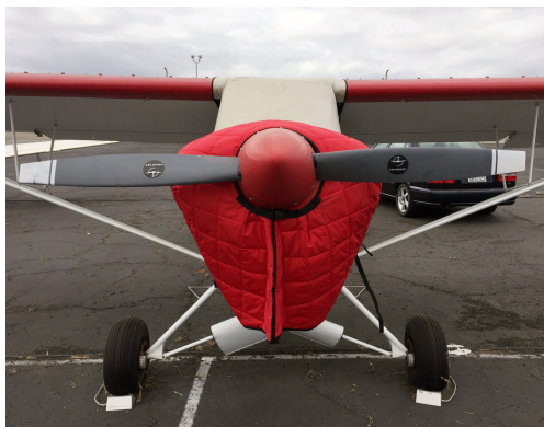
Zenith CH 750 Insulated Engine Cover