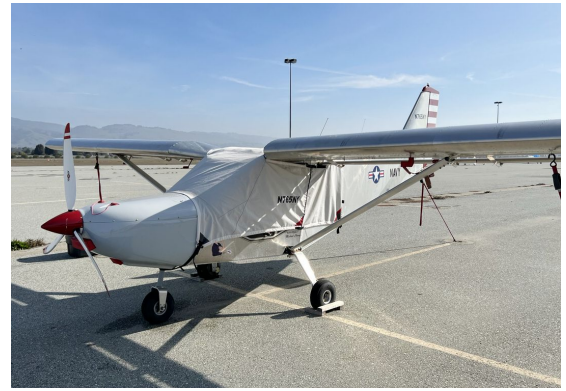
Zenair 750 & Cruiser Extended Canopy Cover