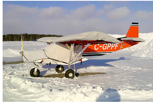
Zenith 701 Canopy, Wing, Tail & Insulated Engine Covers