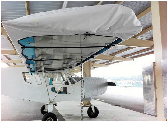
Zenith 801 Wing & Insulated Engine Covers

WINTER USE MATERIAL - Made with Solution-Dyed Polyester fabric, this option is intended for seasonal use to aid in deicing, rain mitigation, or for occasional travel. The material is lighter and more compact, but more susceptible to UV damage and may have a shorter useful life if used continuously outside than the all-year use material.