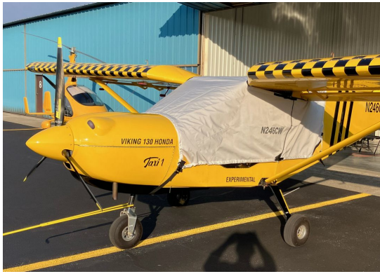
Zenith 750 Cruiser Canopy Cover (Over-The-Top Style)