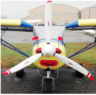
Zenith 701 Engine Inlet Plugs