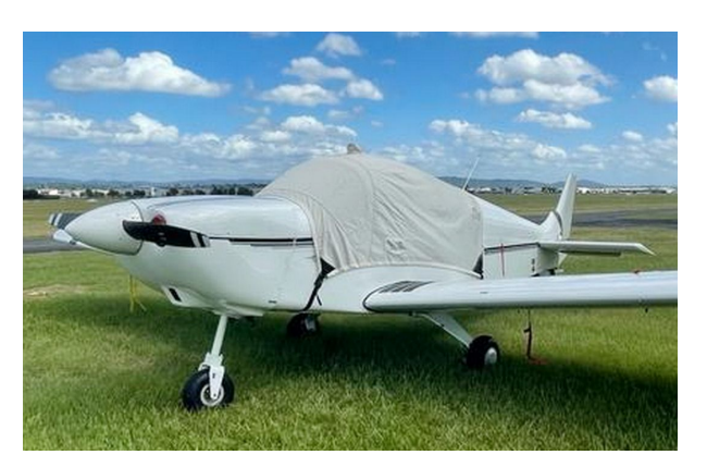
AMD Alarus CH2000 Std Canopy Cover & Engine Plugs (Illustration)