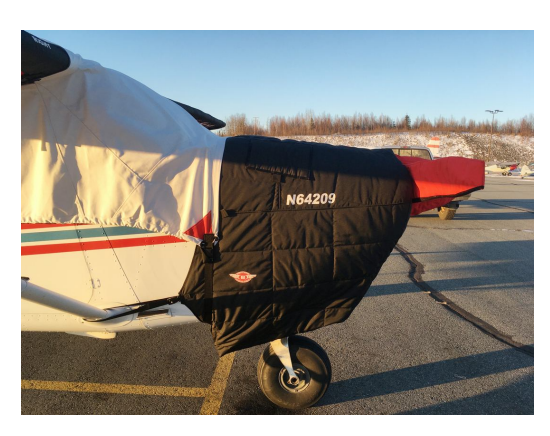
Cessna 172M Canopy, Wings, Horiz. Stab., Insulated Engine & Cessna 172M Canopy, Wings, Horiz. Stab., Insulated Engine & Prop Covers Prop Covers