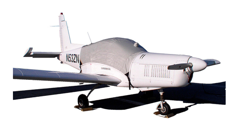
Zlin 142 Canopy Cover

This cover type is made from Silver Acrylic Sunbrella canvas and is 100% lined with a soft and smooth microfiber. Bruce's Custom Covers developed this material combination especially for aircraft protection. The outer material is medium weight and treated for water resistance, UV resistance and anti-static buildup. The inner lining is a very soft and smooth microfiber to prevent scratching. The material is very reflective, and tests show that the cabin interior temperature can be reduced to near-ambient temperature on the hottest of days. It is water, ice and snow repellent, yet breathable to allow moisture to escape from between the cover and the aircraft surface.