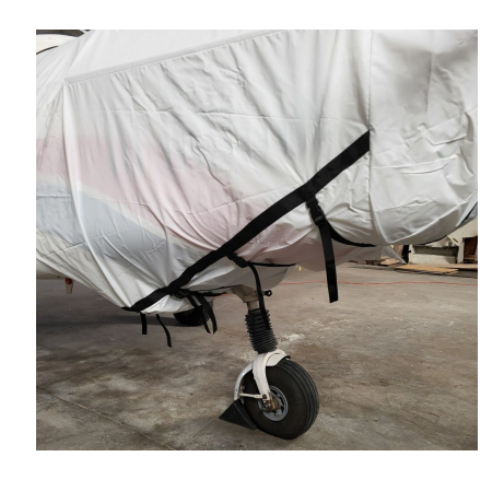
Zlin 142C Engine Cover, test fit cover

This cover type is made from Silver Acrylic Sunbrella canvas and is 100% lined with a soft and smooth microfiber. Bruce's Custom Covers developed this material combination especially for aircraft protection. The outer material is medium weight and treated for water resistance, UV resistance and anti-static buildup. The inner lining is a very soft and smooth microfiber to prevent scratching. The material is very reflective, and tests show that the cabin interior temperature can be reduced to near-ambient temperature on the hottest of days. It is water, ice and snow repellent, yet breathable to allow moisture to escape from between the cover and the aircraft surface.