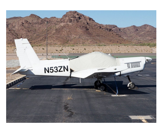
Zlin 142 Canopy Cover