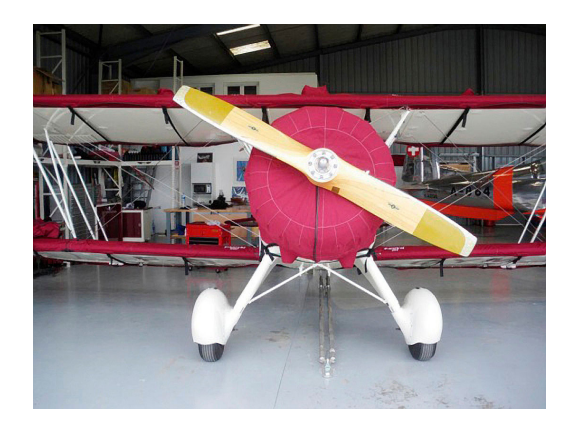
Waco UPF-7 Engine Cover

WINTER USE MATERIAL - Made with Solution-Dyed Polyester fabric, this option is intended for seasonal use to aid in deicing, rain mitigation, or for occasional travel. The material is lighter and more compact, but more susceptible to UV damage and may have a shorter useful life if used continuously outside than the all-year use material.