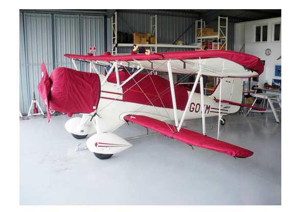
Waco UPF-7 Canopy, Wings, Stab's, Engine, Prop Covers