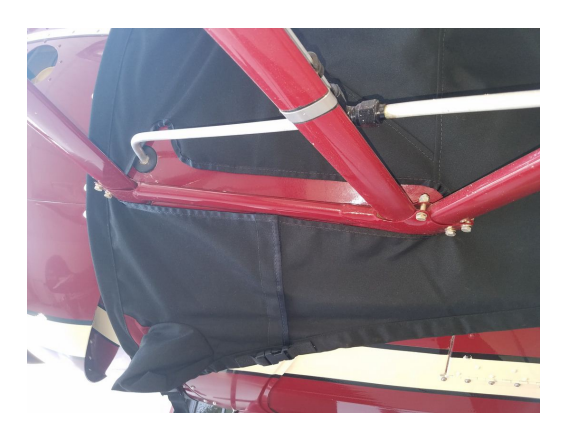
Waco UPF-7 Canopy Cover

Travel Air 4000 Canopy and Engine Covers, light weight travel type