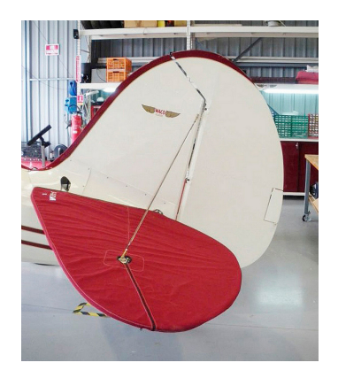
Waco UPF-7 Horizontal Stab. Cover