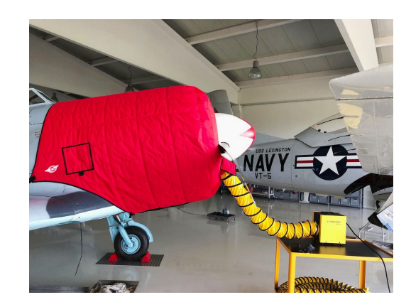
Yak 55 Full Fuselage Cover w/ Detachable Wing Covers & Propellor/Spinner Cover