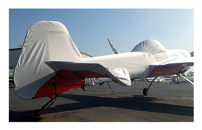
Yak 55 Full Fuselage Cover w/ Detachable Wing Covers & Propellor/Spinner Cover