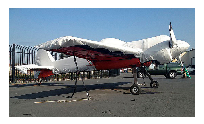
Yak 55 Full Fuselage Cover w/ Detachable Wing Covers & Propellor/Spinner Cover

reflective, and tests show that the cabin interior temperature can be reduced to near-ambient temperature on the hottest of days. It is water, ice and snow repellent, yet breathable to allow moisture to escape from between the cover and the aircraft surface.