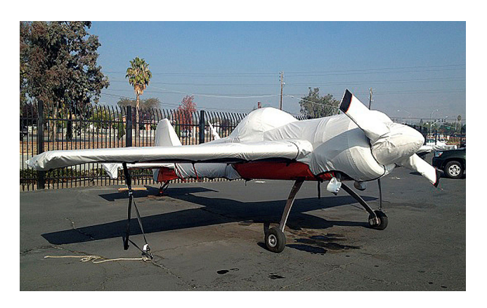
Yak 55 Full Fuselage Cover w/ Detachable Wing Covers & Propellor/Spinner Cover