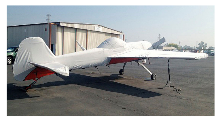
Yak 55 Full Fuselage Cover w/ Detachable Wing Covers & Propellor/Spinner Cover