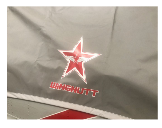
YAK 52TW Lightweight Travel Cover with Custom Artwork Imprint