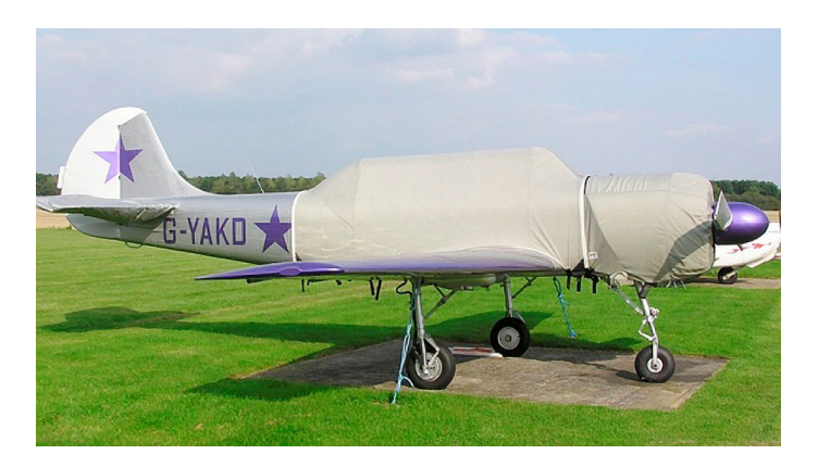
Yak 52 Extended Canopy, Engine & Horiz. Stab. Covers