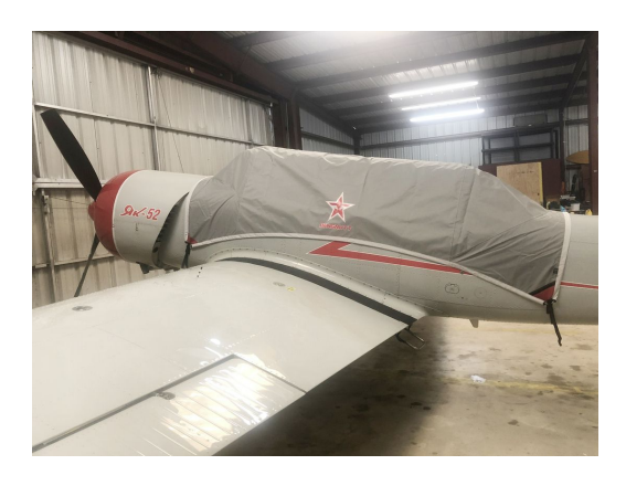
YAK 52TW Lightweight Travel Cover with Custom Artwork Imprint