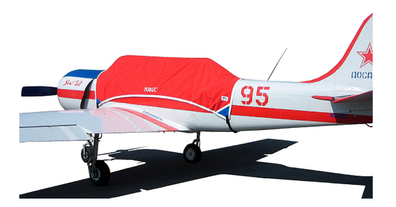
Yak 52 Canopy Cover