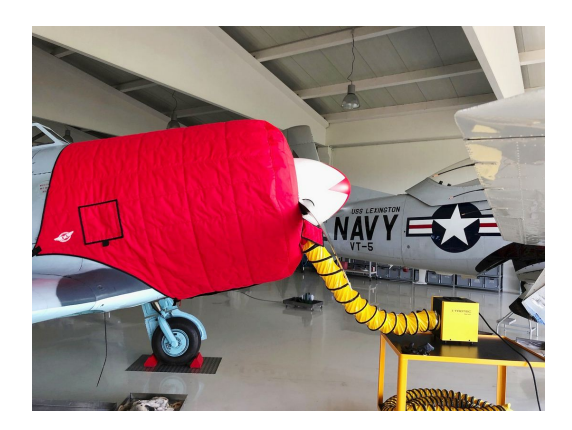
Yak 11 Insulated Engine Cover

This cover type is made from Silver Acrylic Sunbrella canvas and is 100% lined with a soft and smooth microfiber. Bruce's Custom Covers developed this material combination especially for aircraft protection. The outer material is medium weight and treated for water resistance, UV resistance and anti-static buildup. The inner lining is a very soft and smooth microfiber to prevent scratching. The material is very reflective, and tests show that the cabin interior temperature can be reduced to near-ambient temperature on the hottest of days. It is water, ice and snow repellent, yet breathable to allow moisture to escape from between the cover and the aircraft surface.