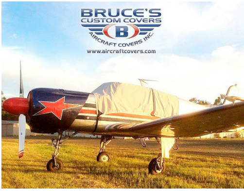
Yak 18 Canopy Cover