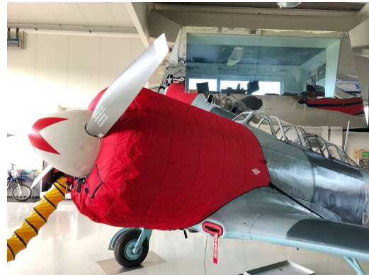
Yak 11 Insulated Engine Cover & Oil Cooler Inlet Plug