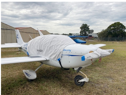
XL-2 CANOPY COVER

This cover type is made from Silver Acrylic Sunbrella canvas and is 100% lined with a soft and smooth microfiber. Bruce's Custom Covers developed this material combination especially for aircraft protection. The outer material is medium weight and treated for water resistance, UV resistance and anti-static buildup. The inner lining is a very soft and smooth microfiber to prevent scratching. The material is very reflective, and tests show that the cabin interior temperature can be reduced to near-ambient temperature on the hottest of days. It is water, ice and snow repellent, yet breathable to allow moisture to escape from between the cover and the aircraft surface.