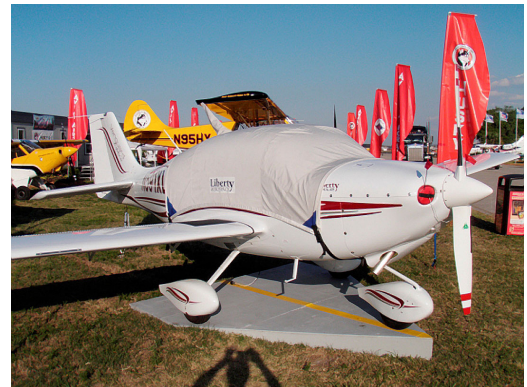
XL-2 Canopy Cover & Engine Plugs