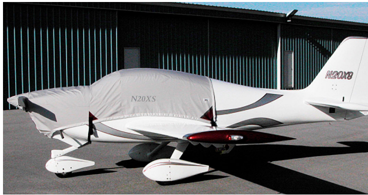
Canopy/Engine and Prop/Spinner Covers (tri-gear model)

Travel Covers are made with Silver Solution-Dyed Polyester fabric and only lined over the windshield to save weight. The material is lightweight and more compact for easy stowage in the aircraft. The polyester material is water resistant, but only intended for occasional use outside. We also have an ultra lightweight material available for fitted hangar dust covers. For daily outdoor use, the non-travel Sunbrella Cover is the best choice.