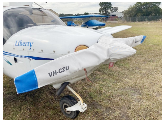
XL-2 PROPELLOR/SPINNER COVER