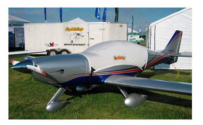
Lightning Canopy Cover