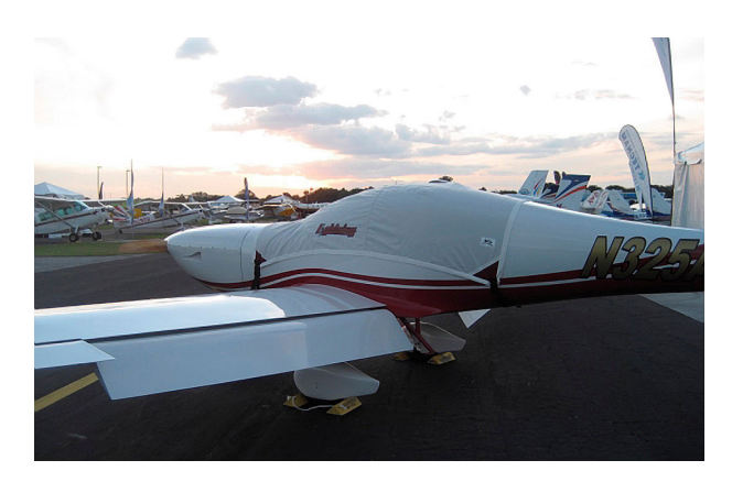
Arion Lightning Canopy Cover

This cover type is made from Silver Acrylic Sunbrella canvas and is 100% lined with a soft and smooth microfiber. Bruce's Custom Covers developed this material combination especially for aircraft protection. The outer material is medium weight and treated for water resistance, UV resistance and anti-static buildup. The inner lining is a very soft and smooth microfiber to prevent scratching. The material is very reflective, and tests show that the cabin interior temperature can be reduced to near-ambient temperature on the hottest of days. It is water, ice and snow repellent, yet breathable to allow moisture to escape from between the cover and the aircraft surface.