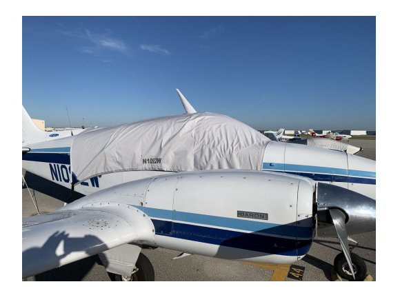
Beech Baron Canopy Cover