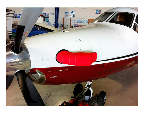
Pilatus PC-12 Exhaust Cover, Fully Enclosed, for protection against corrosion.