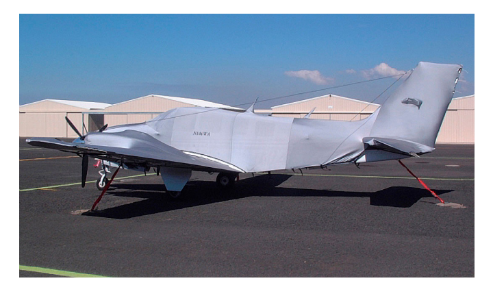
Baron FULL COVER SET, Light Weight Travel &/or Fitted Dust Cover Set