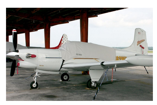
Beech Harpoon Canopy Cover, Exhaust Covers, Engine Plug

Prop Tie-Down/Exhaust Covers are made of heavy duty red vinyl material. Thick nylon webbing runs from the exhaust covers to the prop boot. This webbing is adjustable with plastic buckles, and is held tight with a steel spring where it attaches to the prop boot.