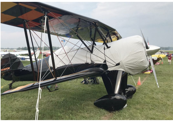
Waco Taperwing Cockpit & Engine Covers