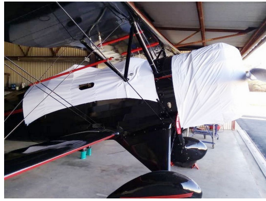
Waco UMF Canopy & Engine Covers, test fit prototypes