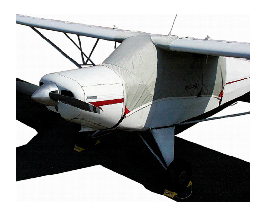
Piper PA-12 Super Cruiser Over-Top Canopy Cover