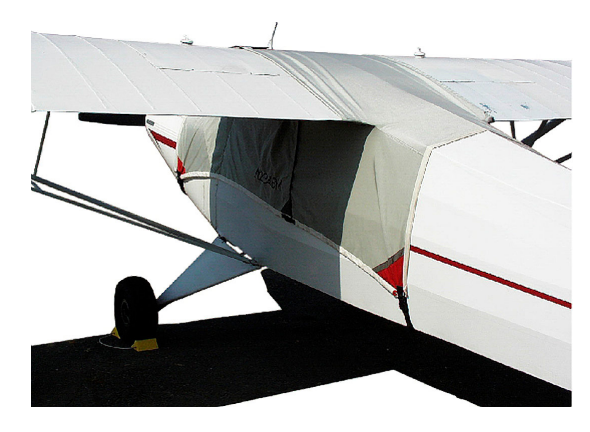
Piper PA-12 Super Cruiser Over-Top Canopy Cover

This cover type is made from Silver Acrylic Sunbrella canvas and is 100% lined with a soft and smooth microfiber. Bruce's Custom Covers developed this material combination especially for aircraft protection. The outer material is medium weight and treated for water resistance, UV resistance and anti-static buildup. The inner lining is a very soft and smooth microfiber to prevent scratching. The material is very reflective, and tests show that the cabin interior temperature can be reduced to near-ambient temperature on the hottest of days. It is water, ice and snow repellent, yet breathable to allow moisture to escape from between the cover and the aircraft surface.