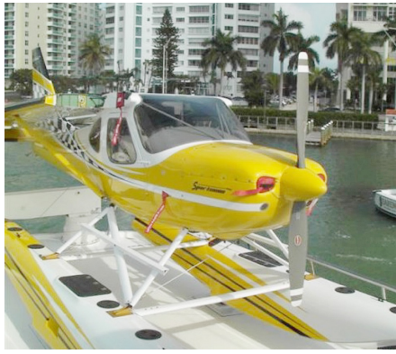
Glstar Engine Plugs