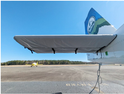
Vashon R7 Ranger Horiz. Stab. Covers, fully enclosed

WINTER USE MATERIAL - Made with Solution-Dyed Polyester fabric, this option is intended for seasonal use to aid in deicing, rain mitigation, or for occasional travel. The material is lighter and more compact, but more susceptible to UV damage and may have a shorter useful life if used continuously outside than the all-year use material.