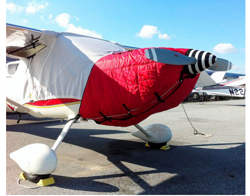
Glastar Insulated Engine Cover