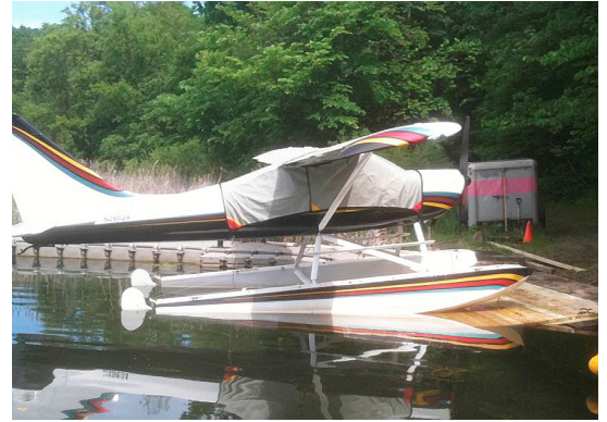
Glastar Sportsman Canopy Cover