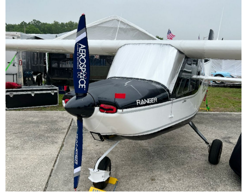
Vashon Ranger Engine Inlet Plugs