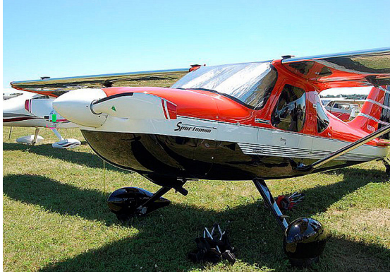
Glstar Sportsman Windshield HeatShield

window framing. It folds up flat and easily stores in the included storage sleeve. Some designs may require velcro and suction cups or split right and left sides. A Heatshield is an excellent short-term remedy for cockpit overheating. An external fabric cover is far more effective and practical for long-term protection.