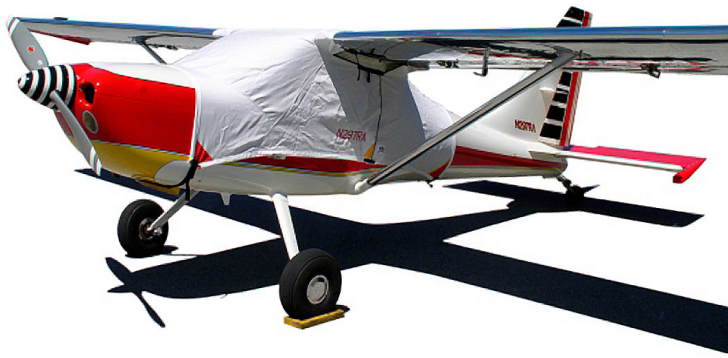
Glastar Over-Top Canopy Cover