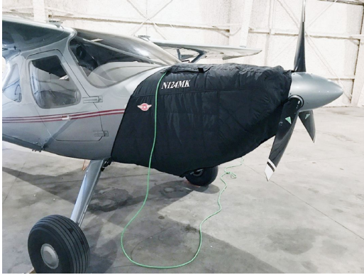
Glasair Aviation Glastar, Sportsman 2+2 Insulated Engine Cover

water resistance, UV resistance and anti-static buildup. The inner lining is a very soft and smooth microfiber to prevent scratching. The material is very reflective, and tests show that the cabin interior temperature can be reduced to near-ambient temperature on the hottest of days. It is water, ice and snow repellent, yet breathable to allow moisture to escape from between the cover and the aircraft surface.