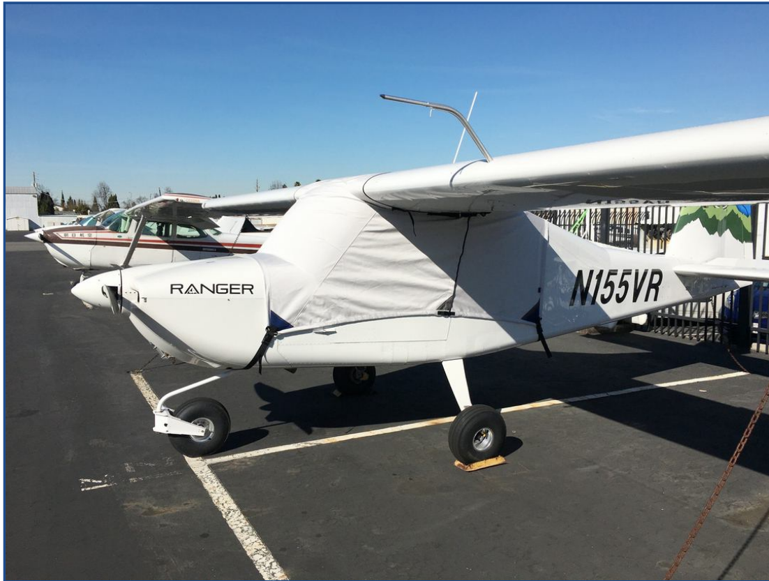
Vashon Ranger R7 Canopy Cover, Over-Top Type