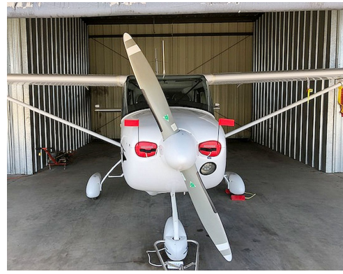
2006 OMF Symphony SA160