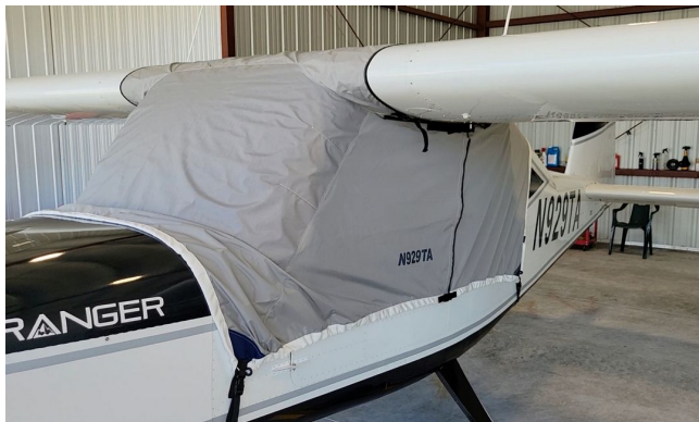
Vashon Ranger R7 Travel Weight Canopy Cover

Travel Covers are made with Silver Solution-Dyed Polyester fabric and only lined over the windshield to save weight. The material is lightweight and more compact for easy stowage in the aircraft. The polyester material is water resistant, but only intended for occasional use outside. We also have an ultra lightweight material available for fitted hangar dust covers. For daily outdoor use, the non-travel Sunbrella Cover is the best choice.