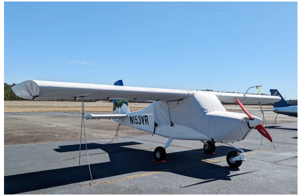
Vashon R7 Ranger Canopy/Engine, Wing & Horiz. Stab. Covers