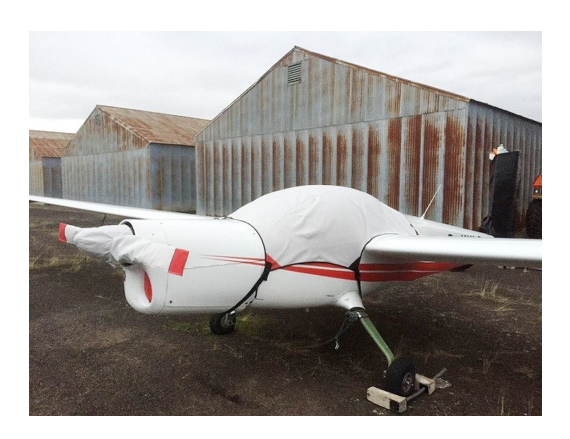
Vivat Canopy and Prop/Spinner Cover