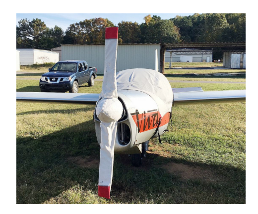
Aerotechnik L-13 Vivat Motorglider Prop/Spinner & Canopy Covers