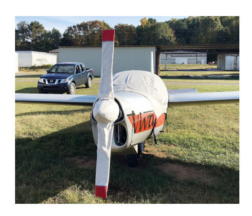
Aerotechnik L-13 Vivat Motorglider Prop/Spinner & Canopy Covers