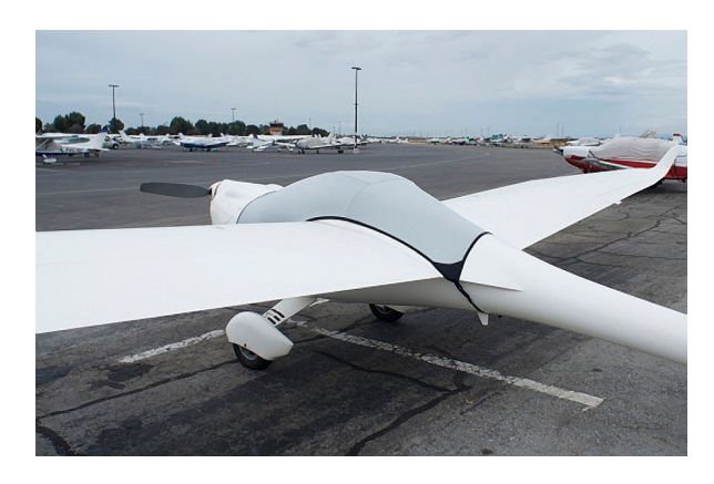
Lambada Canopy/Engine Cover and Wing Covers