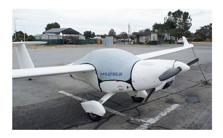
Lambada Travel Canopy Cover