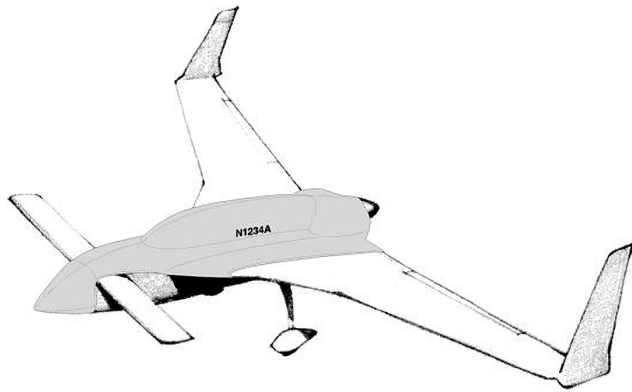
Rutan Long-EZ Canopy Cover