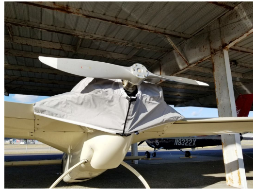
Rutan Vari EZ Travel Cover/Nose/Engine Cover