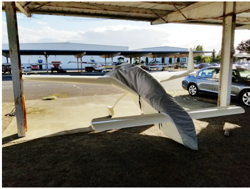
Rutan Vari EZ Travel Cover/Nose/Engine Cover