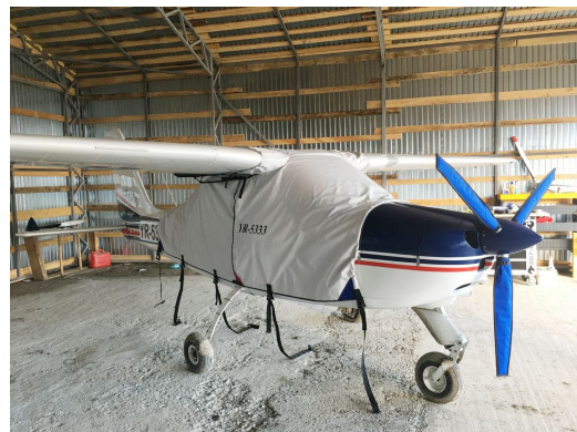
Tecnam P2004 Bravo Extended Canopy Cover, Over-Top Type