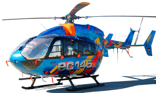
EC-145 Cabin Heatshield Set