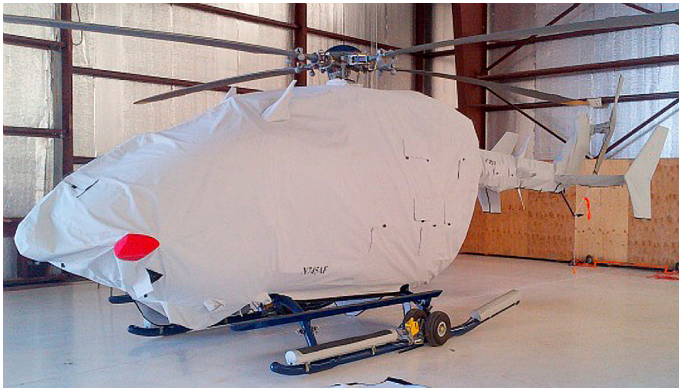
Main Body (also covers bottom), Tailboom, Vertical Pylon, Stabilizers and Tail Rotor Covers

Covers developed this material combination especially for aircraft protection. The outer material is medium weight and treated for water resistance, UV resistance and anti-static buildup. The inner lining is a very soft and smooth microfiber to prevent scratching. The material is very reflective, and tests show that the cabin interior temperature can be reduced to near-ambient temperature on the hottest of days. It is water, ice and snow repellent, yet breathable to allow moisture to escape from between the cover and the aircraft surface.