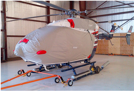
Bubble Cover w/ nose mounted radome & Upper Deck Plugs/Cover