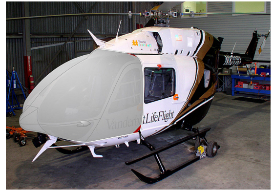
EC-145 Windshield/Nose Cover (illustration)