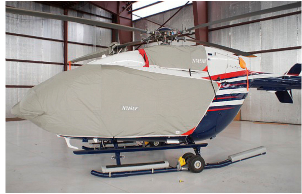
Upper Deck Plugs/Cover, extended to cover aft intake vents Bubble Cover w/ nose mounted radome, Upper Deck Plugs/Cover