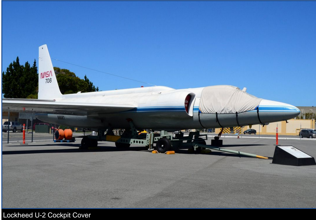
Lockheed U-2 Cockpit Cover