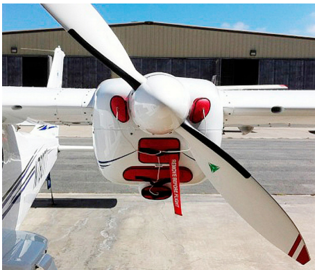
Tecnam P2006T Engine Plugs

Engine Inlet Plugs are custom fit for your Tecnam P2012 Traveller intakes, made with heavy-duty vinyl material, and stuffed with a single block of sculpted urethane foam. Each plug has a zipper that allows the foam to be removed and dried if necessary. Engine plugs have warning flags that are visible from the cockpit or 'remove before flight' streamers sewn onto the face of the plugs. Most plugs are imprinted with the aircraft registration number in black for an extra charge. Storage bag NOT included. Engine plugs may be inserted after flight when the engine is still warm. Engine Inlet Plugs are commonly referred to as Cowl Plugs, Intake Plugs, Cowl Blocks, Engine Blocks, and Engine Bungs.