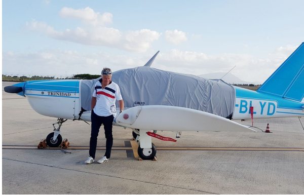
Socata Tampico, Tobago & Trinidad Travel Cover, Light Weight Canopy Cover

Travel Covers are made with Silver Solution-Dyed Polyester fabric and only lined over the windshield to save weight. The material is lightweight and more compact for easy stowage in the aircraft. The polyester material is water resistant, but only intended for occasional use outside. We also have an ultra lightweight material available for fitted hangar dust covers. For daily outdoor use, the non-travel Sunbrella Cover is the best choice.