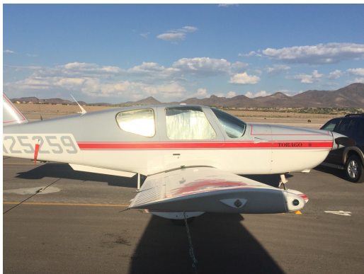
Socata TB-10 Cabin HeatShields

Windshield Heatshields are interior sunshades for an aircraft's front windshield. The product is a unique composite of closed-cell foam with a silver mylar finish. The semi-rigid design is stiff enough to stand along the inside of the windshield using sun visors or window framing. It folds up flat and easily stores in the included storage sleeve. Some designs may require velcro and suction cups or split right and left sides. A Heatshield is an excellent short-term remedy for cockpit overheating. An external fabric cover is far more effective and practical for long-term protection.