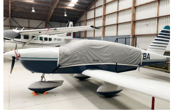
Socata TB-9 TRAVEL COVER, Light Weight Canopy Cover