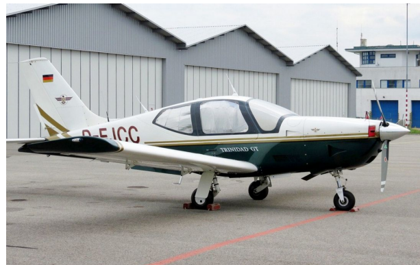
Socata Tobago TB20 Heatshields