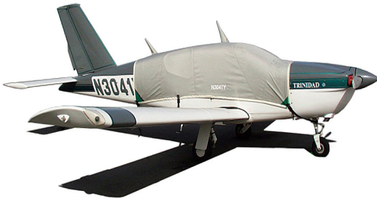
Trinidad/Tobago Standard Canopy Cover & Engine Plugs

This cover type is made from Silver Acrylic Sunbrella canvas and is 100% lined with a soft and smooth microfiber. Bruce's Custom Covers developed this material combination especially for aircraft protection. The outer material is medium weight and treated for water resistance, UV resistance and anti-static buildup. The inner lining is a very soft and smooth microfiber to prevent scratching. The material is very reflective, and tests show that the cabin interior temperature can be reduced to near-ambient temperature on the hottest of days. It is water, ice and snow repellent, yet breathable to allow moisture to escape from between the cover and the aircraft surface.