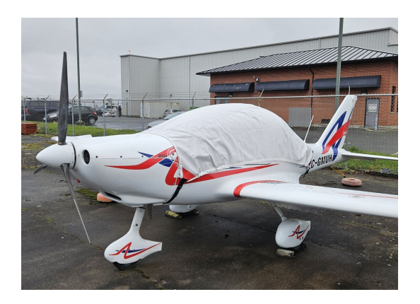
TL 2000 Sting Sport Canopy Cover

This cover type is made from Silver Acrylic Sunbrella canvas and is 100% lined with a soft and smooth microfiber. Bruce's Custom Covers developed this material combination especially for aircraft protection. The outer material is medium weight and treated for water resistance, UV resistance and anti-static buildup. The inner lining is a very soft and smooth microfiber to prevent scratching. The material is very reflective, and tests show that the cabin interior temperature can be reduced to near-ambient temperature on the hottest of days. It is water, ice and snow repellent, yet breathable to allow moisture to escape from between the cover and the aircraft surface.