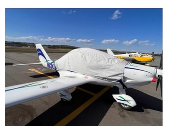
TL 2000 Sting Travel Weight Canopy Cover