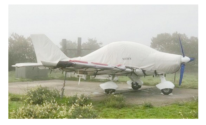
TL Sting Sport Full Cover Set

WINTER USE MATERIAL - Made with Solution-Dyed Polyester fabric, this option is intended for seasonal use to aid in deicing, rain mitigation, or for occasional travel. The material is lighter and more compact, but more susceptible to UV damage and may have a shorter useful life if used continuously outside than the all-year use material.