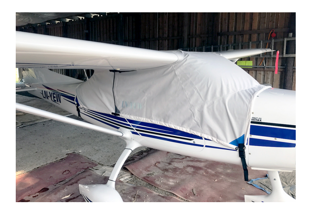
TL Ultralight Sirius TL-3000 Canopy Cover (Over-The-Top Style) TL Ultralight Sirius TL-3000 Canopy Cover (Over-The-Top Style)