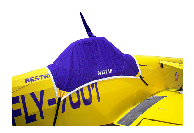
Piper Pawnee Canopy Cover

This cover type is made from Silver Acrylic Sunbrella canvas and is 100% lined with a soft and smooth microfiber. Bruce's Custom Covers developed this material combination especially for aircraft protection. The outer material is medium weight and treated for water resistance, UV resistance and anti-static buildup. The inner lining is a very soft and smooth microfiber to prevent scratching. The material is very reflective, and tests show that the cabin interior temperature can be reduced to near-ambient temperature on the hottest of days. It is water, ice and snow repellent, yet breathable to allow moisture to escape from between the cover and the aircraft surface.