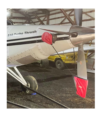
Ayres Thrush Prop Tie/Exhaust Covers