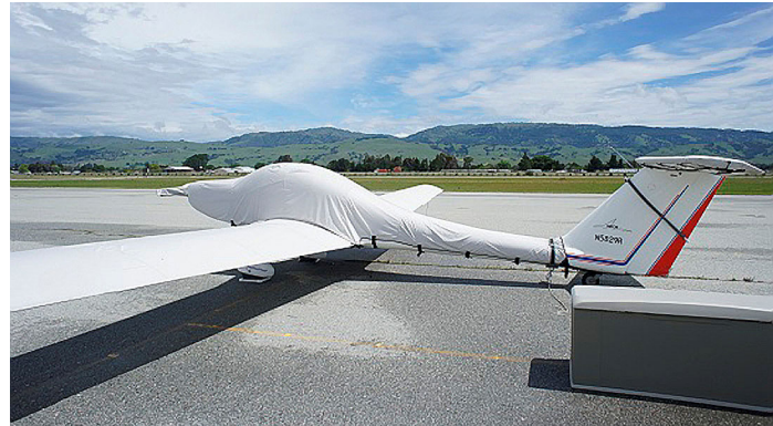
Lambda Canopy/Engine Cover and Wing Covers Grob 109 Canopy/Engine w/ extension to tail, Wing, Stabilizer & Prop/Spinner Covers