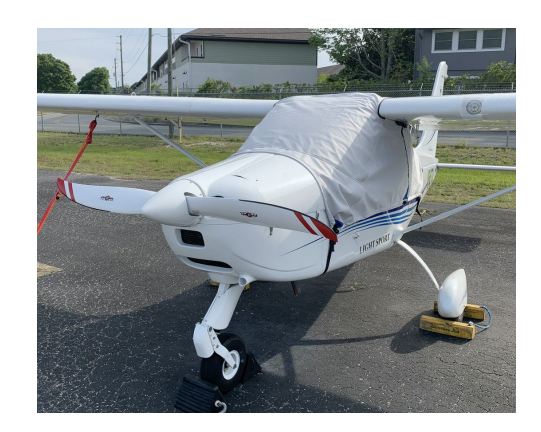
Tecnam P92 EAGLET Canopy Cover Over the Top Style