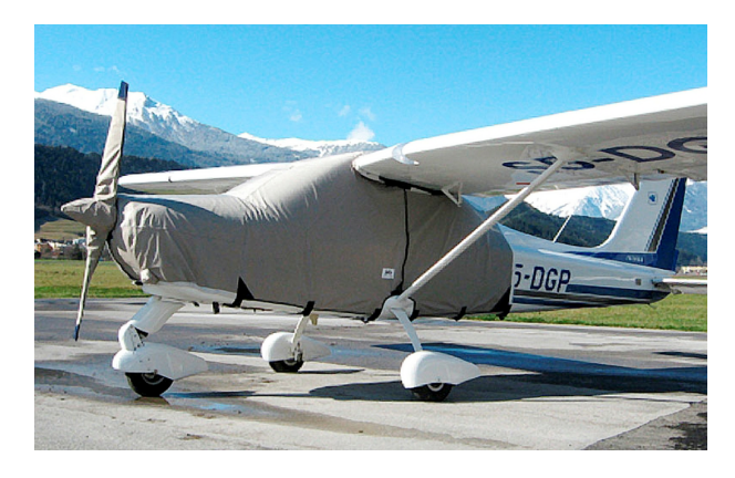
Tecnam Echo Extended Canopy, Engine, Prop Covers