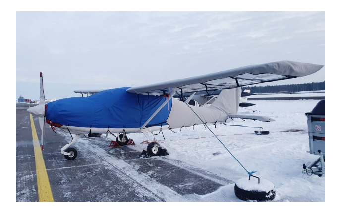
Tecnam P2010 Wing, Empennage & Prop Covers

This cover type is made from Silver Acrylic Sunbrella canvas and is 100% lined with a soft and smooth microfiber. Bruce's Custom Covers developed this material combination especially for aircraft protection. The outer material is medium weight and treated for water resistance, UV resistance and anti-static buildup. The inner lining is a very soft and smooth microfiber to prevent scratching. The material is very reflective, and tests show that the cabin interior temperature can be reduced to near-ambient temperature on the hottest of days. It is water, ice and snow repellent, yet breathable to allow moisture to escape from between the cover and the aircraft surface.