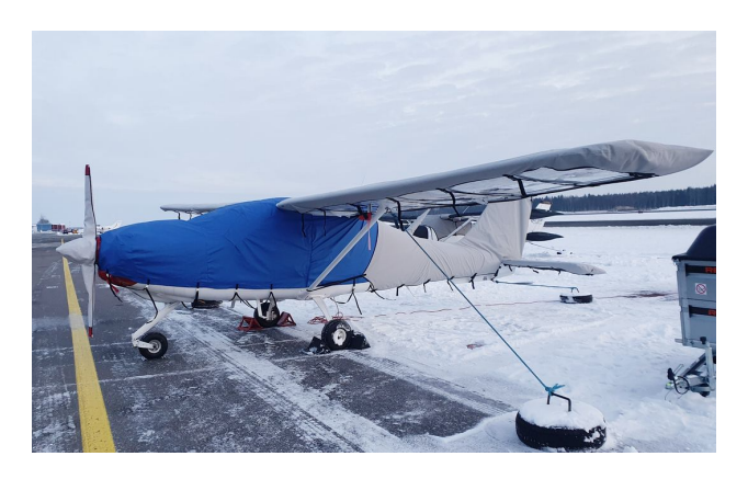
Tecnam P2010 Wing, Empennage & Prop Covers

WINTER USE MATERIAL - Made with Solution-Dyed Polyester fabric, this option is intended for seasonal use to aid in deicing, rain mitigation, or for occasional travel. The material is lighter and more compact, but more susceptible to UV damage and may have a shorter useful life if used continuously outside than the all-year use material.