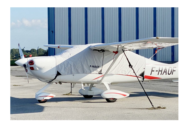
Tecnam P2010 Over-Top Canopy Cover, Engine Plugs