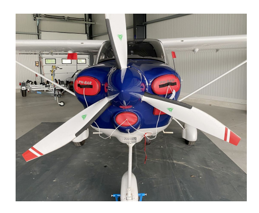
Tecnam P2010 Engine Inlet Plugs

Engine Inlet Plugs are custom fit for your Tecnam P2010 intakes, made with heavy-duty vinyl material, and stuffed with a single block of sculpted urethane foam. Each plug has a zipper that allows the foam to be removed and dried if necessary. Engine plugs have warning flags that are visible from the cockpit or 'remove before flight' streamers sewn onto the face of the plugs. Most plugs are imprinted with the aircraft registration number in black for an extra charge. Storage bag NOT included. Engine plugs may be inserted after flight when the engine is still warm. Engine Inlet Plugs are commonly referred to as Cowl Plugs, Intake Plugs, Cowl Blocks, Engine Blocks, and Engine Bungs.