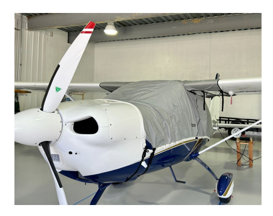
Tecnam P2010 Lightweight Travel Canopy Cover

Travel Covers are made with Silver Solution-Dyed Polyester fabric and only lined over the windshield to save weight. The material is lightweight and more compact for easy stowage in the aircraft. The polyester material is water resistant, but only intended for occasional use outside. We also have an ultra lightweight material available for fitted hangar dust covers. For daily outdoor use, the non-travel Sunbrella Cover is the best choice.