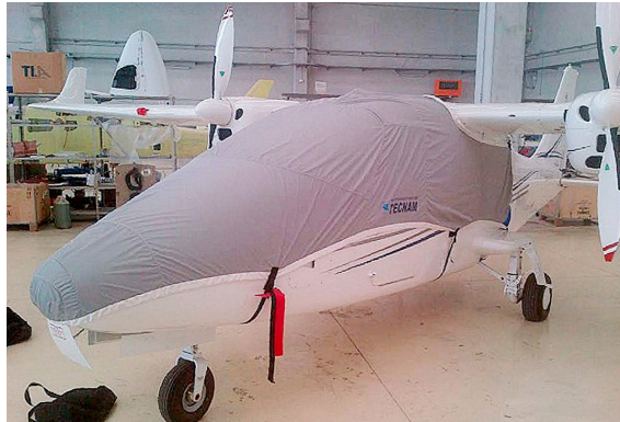
Tecnam P2006T Twin Lightweight Travel Canopy/Nose Cover

Travel Covers are made with Silver Solution-Dyed Polyester fabric and only lined over the windshield to save weight. The material is lightweight and more compact for easy stowage in the aircraft. The polyester material is water resistant, but only intended for occasional use outside. We also have an ultra lightweight material available for fitted hangar dust covers. For daily outdoor use, the non-travel Sunbrella Cover is the best choice.