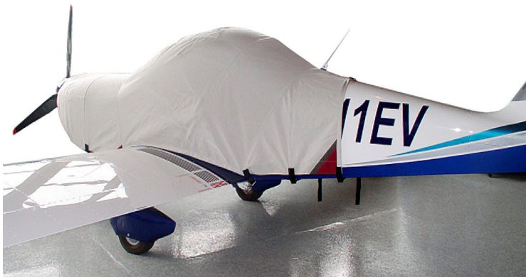
Evektor Sportstar Extended Canopy/Engine Cover

This cover type is made from Silver Acrylic Sunbrella canvas and is 100% lined with a soft and smooth microfiber. Bruce's Custom Covers developed this material combination especially for aircraft protection. The outer material is medium weight and treated for water resistance, UV resistance and anti-static buildup. The inner lining is a very soft and smooth microfiber to prevent scratching. The material is very reflective, and tests show that the cabin interior temperature can be reduced to near-ambient temperature on the hottest of days. It is water, ice and snow repellent, yet breathable to allow moisture to escape from between the cover and the aircraft surface.