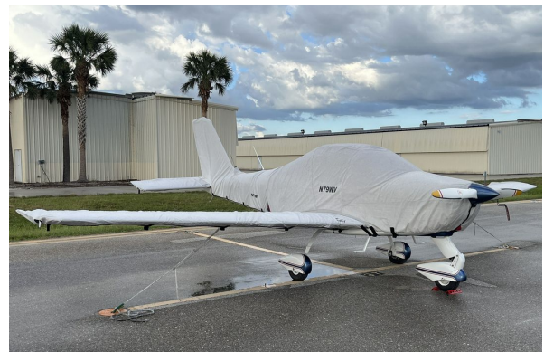
Tecnam P2002 Sierra Complete Cover Set