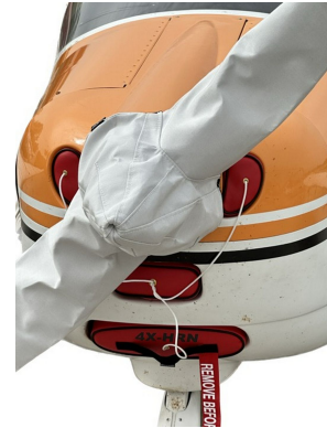
Tecnam P2002 Sierra Engine Plug Set