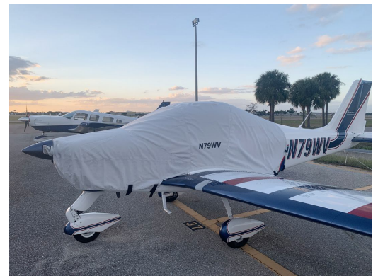
Tecnam Sierra Extended Canopy/Engine Cover