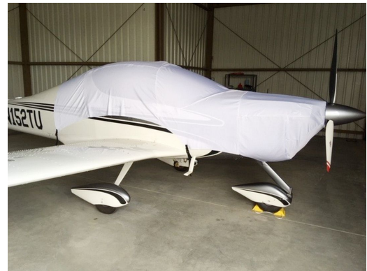
Tecnam Astore Canopy/Engine Cover, test fit cover