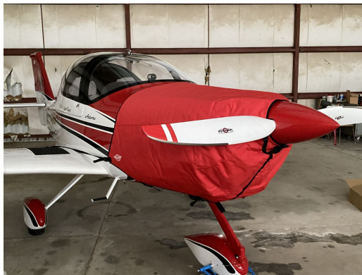
Tecnam Astore Insulated Engine Cover

This cover type is made from Silver Acrylic Sunbrella canvas and is 100% lined with a soft and smooth microfiber. Bruce's Custom Covers developed this material combination especially for aircraft protection. The outer material is medium weight and treated for water resistance, UV resistance and anti-static buildup. The inner lining is a very soft and smooth microfiber to prevent scratching. The material is very reflective, and tests show that the cabin interior temperature can be reduced to near-ambient temperature on the hottest of days. It is water, ice and snow repellent, yet breathable to allow moisture to escape from between the cover and the aircraft surface.