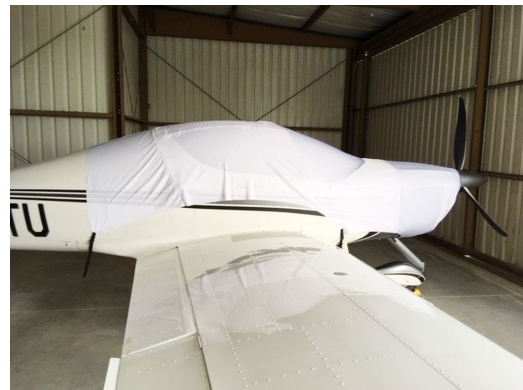
Tecnam Astore Canopy/Engine Cover, test fit cover