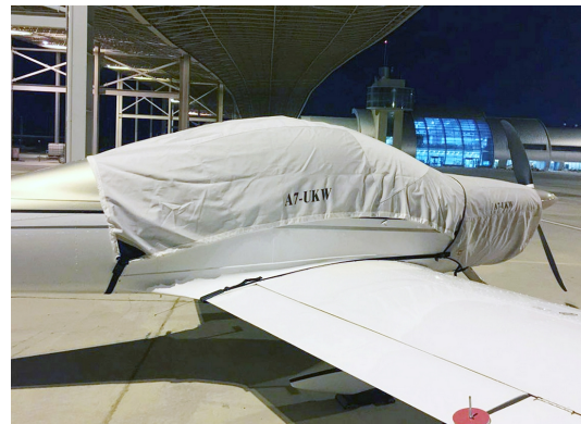
Tecnam Astore Canopy & Engine Covers