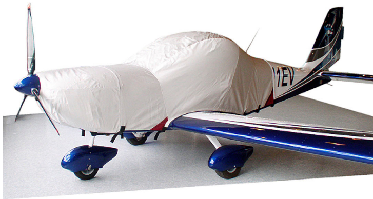
Evezor Sportstar Extended Canopy/Engine Cover

This cover type is made from Silver Acrylic Sunbrella canvas and is 100% lined with a soft and smooth microfiber. Bruce's Custom Covers developed this material combination especially for aircraft protection. The outer material is medium weight and treated for water resistance, UV resistance and anti-static buildup. The inner lining is a very soft and smooth microfiber to prevent scratching. The material is very reflective, and tests show that the cabin interior temperature can be reduced to near-ambient temperature on the hottest of days. It is water, ice and snow repellent, yet breathable to allow moisture to escape from between the cover and the aircraft surface.