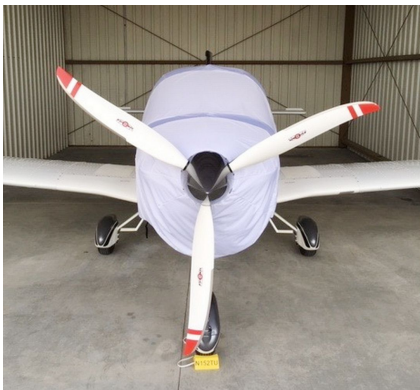
Tecnam Astore Canopy/Engine Cover, test fit cover

Travel Covers are made with Silver Solution-Dyed Polyester fabric and only lined over the windshield to save weight. The material is lightweight and more compact for easy stowage in the aircraft. The polyester material is water resistant, but only intended for occasional use outside. We also have an ultra lightweight material available for fitted hangar dust covers. For daily outdoor use, the non-travel Sunbrella Cover is the best choice.