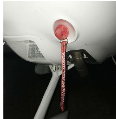
Tecnam P2010 Small Engine Inlet Plug