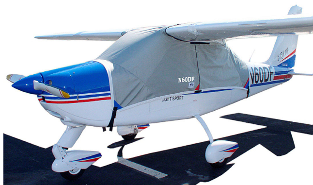
Tecnam Bravo Canopy Cover

This cover type is made from Silver Acrylic Sunbrella canvas and is 100% lined with a soft and smooth microfiber. Bruce's Custom Covers developed this material combination especially for aircraft protection. The outer material is medium weight and treated for water resistance, UV resistance and anti-static buildup. The inner lining is a very soft and smooth microfiber to prevent scratching. The material is very reflective, and tests show that the cabin interior temperature can be reduced to near-ambient temperature on the hottest of days. It is water, ice and snow repellent, yet breathable to allow moisture to escape from between the cover and the aircraft surface.