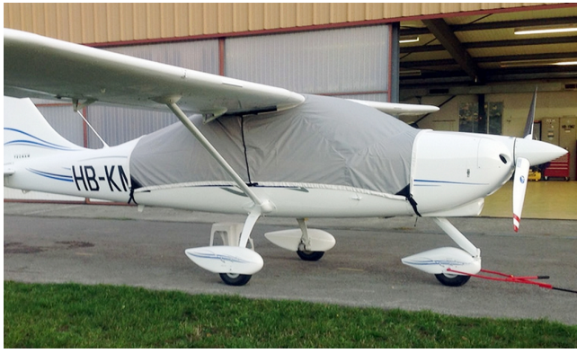
Tecnam P2008 Travel Cover