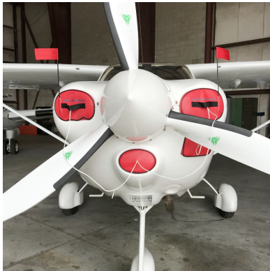
Tecnam P2010 Engine Plugs

Engine Inlet Plugs are custom fit for your Tecnam P2008 intakes, made with heavy-duty vinyl material, and stuffed with a single block of sculpted urethane foam. Each plug has a zipper that allows the foam to be removed and dried if necessary. Engine plugs have warning flags that are visible from the cockpit or 'remove before flight' streamers sewn onto the face of the plugs. Most plugs are imprinted with the aircraft registration number in black for an extra charge. Storage bag NOT included. Engine plugs may be inserted after flight when the engine is still warm. Engine Inlet Plugs are commonly referred to as Cowl Plugs, Intake Plugs, Cowl Blocks, Engine Blocks, and Engine Bungs.