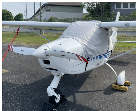
Tecnam P92 EAGLET Canopy Cover Over theTop Style