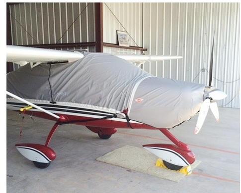
Tecnam P2008 Empennage Cover (Tailboom, Vertical & Horiz Stabilizers), Tecnam P2008 Canopy Cover & Light Weight Engine Cover