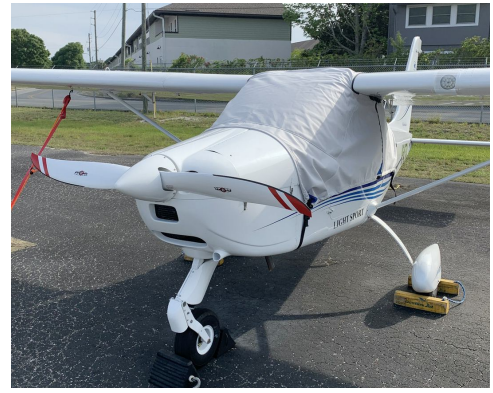
Tecnam P92 EAGLET Canopy Cover Over theTop Style