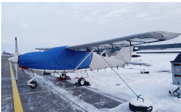
Tecnam P2010 Wing, Empennage & Prop Covers

WINTER USE MATERIAL - Made with Solution-Dyed Polyester fabric, this option is intended for seasonal use to aid in deicing, rain mitigation, or for occasional travel. The material is lighter and more compact, but more susceptible to UV damage and may have a shorter useful life if used continuously outside than the all-year use material.