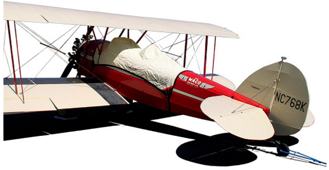
Waco 10 Canopy Cover