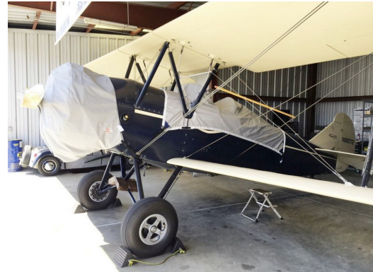
Travelair 4000 Canopy & Engine Covers, light weight travel type Travelair 4000 Canopy & Engine Covers, light weight travel type