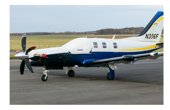
Socata TBM 700 Cockpit Cover (Not Bruce's Prop/Exhaust)