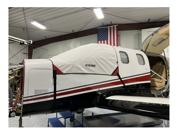
TBM 700 Cockpit Cover

This cover type is made from Silver Acrylic Sunbrella canvas and is 100% lined with a soft and smooth microfiber. Bruce's Custom Covers developed this material combination especially for aircraft protection. The outer material is medium weight and treated for water resistance, UV resistance and anti-static buildup. The inner lining is a very soft and smooth microfiber to prevent scratching. The material is very reflective, and tests show that the cabin interior temperature can be reduced to near-ambient temperature on the hottest of days. It is water, ice and snow repellent, yet breathable to allow moisture to escape from between the cover and the aircraft surface.