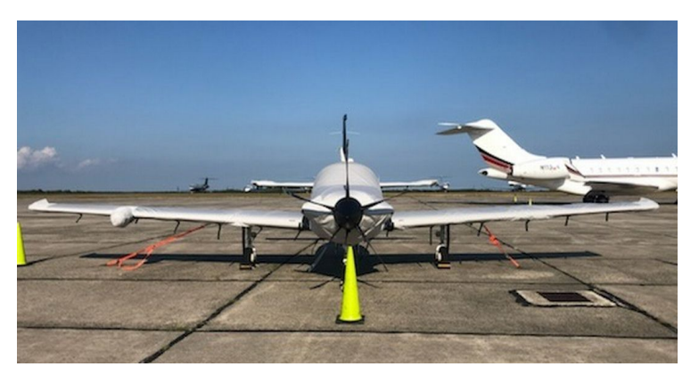
Socata TBM Canopy, Engine, Wing & Horizontal Stabilizer Covers

WINTER USE MATERIAL - Made with Solution-Dyed Polyester fabric, this option is intended for seasonal use to aid in deicing, rain mitigation, or for occasional travel. The material is lighter and more compact, but more susceptible to UV damage and may have a shorter useful life if used continuously outside than the all-year use material.