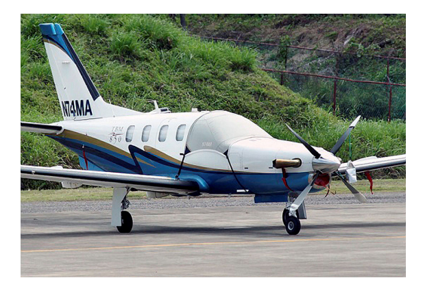
TBM 850 Cockpit Cover

Travel Covers are made with Silver Solution-Dyed Polyester fabric and only lined over the windshield to save weight. The material is lightweight and more compact for easy stowage in the aircraft. The polyester material is water resistant, but only intended for occasional use outside. We also have an ultra lightweight material available for fitted hangar dust covers. For daily outdoor use, the non-travel Sunbrella Cover is the best choice.