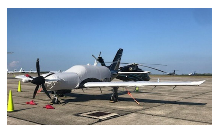
Socata TBM Canopy, Engine, Wing & Horizontal Stabilizer Covers