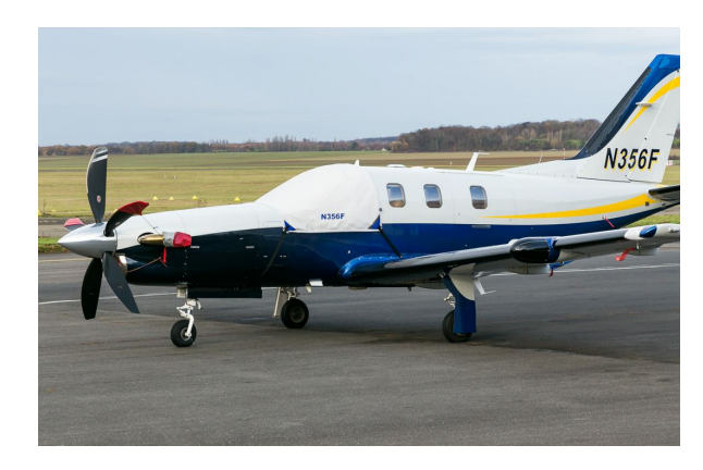
Socata TBM 700 Cockpit Cover (Not Bruce's Prop/Exhaust)