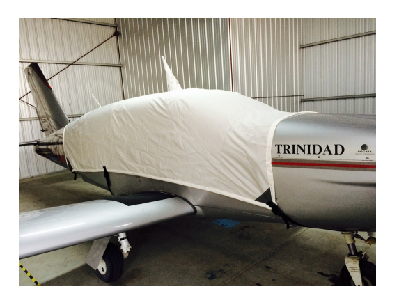
Trinidad Canopy Cover