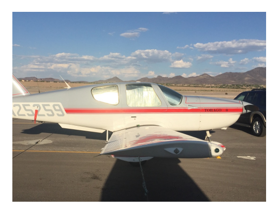
Socata TB-10 Cabin HeatShields

Windshield Heatshields are interior sunshades for an aircraft's front windshield. The product is a unique composite of closed-cell foam with a silver mylar finish. The semi-rigid design is stiff enough to stand along the inside of the windshield using sun visors or window framing. It folds up flat and easily stores in the included storage sleeve. Some designs may require velcro and suction cups or split right and left sides. A Heatshield is an excellent short-term remedy for cockpit overheating. An external fabric cover is far more effective and practical for long-term protection.