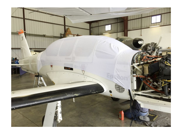
Socata TB30 Epsilon Canopy Cover, test fit cover

Travel Covers are made with Silver Solution-Dyed Polyester fabric and only lined over the windshield to save weight. The material is lightweight and more compact for easy stowage in the aircraft. The polyester material is water resistant, but only intended for occasional use outside. We also have an ultra lightweight material available for fitted hangar dust covers. For daily outdoor use, the non-travel Sunbrella Cover is the best choice.