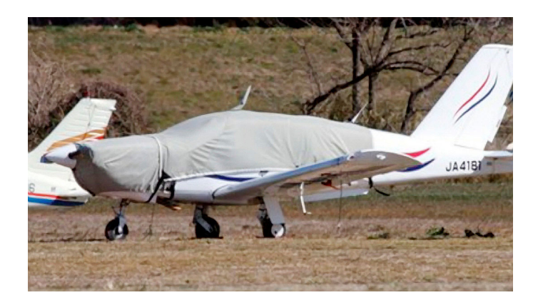
Canopy & Engine Covers