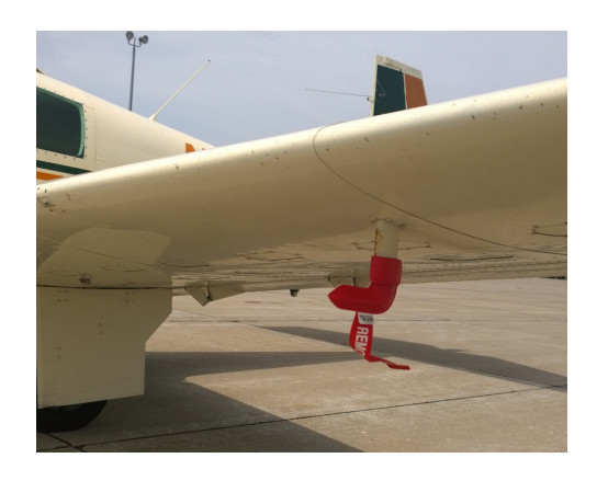
Mooney Pitot Cover