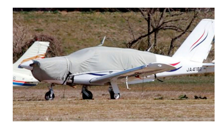
Socata TB-20/21Extended Canopy Cover and Insulated Engine Cover