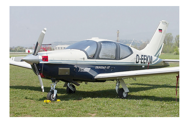
TB-9 Engine Plugs and HeatShields