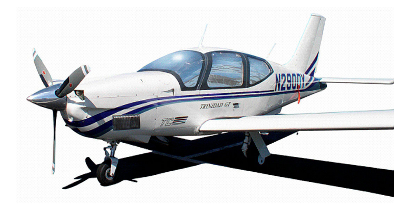
Socata TB20 HeatShields