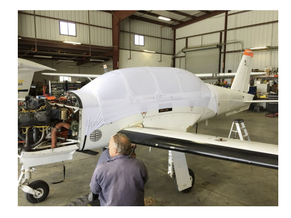
Socata TB30 Epsilon Canopy Cover, test fit cover

This cover type is made from Silver Acrylic Sunbrella canvas and is 100% lined with a soft and smooth microfiber. Bruce's Custom Covers developed this material combination especially for aircraft protection. The outer material is medium weight and treated for water resistance, UV resistance and anti-static buildup. The inner lining is a very soft and smooth microfiber to prevent scratching. The material is very reflective, and tests show that the cabin interior temperature can be reduced to near-ambient temperature on the hottest of days. It is water, ice and snow repellent, yet breathable to allow moisture to escape from between the cover and the aircraft surface.