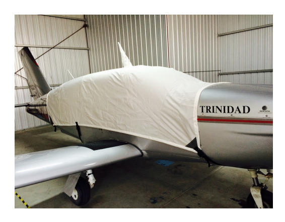
Trinidad Canopy Cover