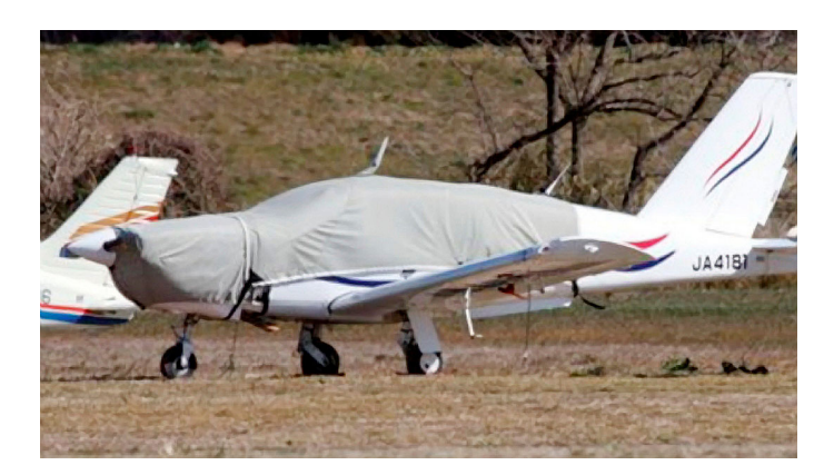
Canopy & Engine Covers

This cover type is made from Silver Acrylic Sunbrella canvas and is 100% lined with a soft and smooth microfiber. Bruce's Custom Covers developed this material combination especially for aircraft protection. The outer material is medium weight and treated for water resistance, UV resistance and anti-static buildup. The inner lining is a very soft and smooth microfiber to prevent scratching. The material is very reflective, and tests show that the cabin interior temperature can be reduced to near-ambient temperature on the hottest of days. It is water, ice and snow repellent, yet breathable to allow moisture to escape from between the cover and the aircraft surface.