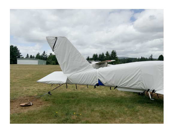
Socata Tampico TB-9C Cover Set