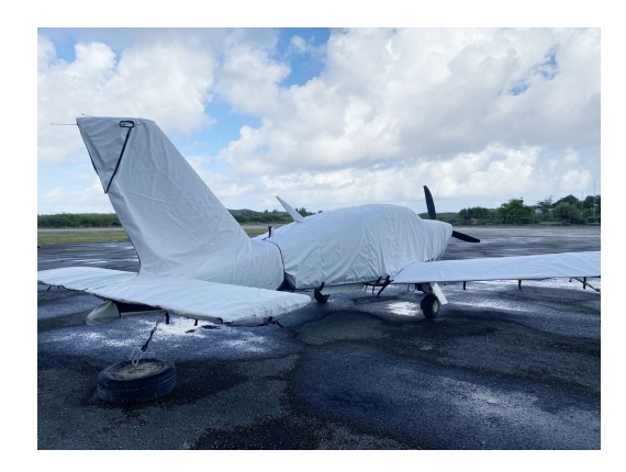
Socata Trinidad Full Cover Set

This cover type is made from Silver Acrylic Sunbrella canvas and is 100% lined with a soft and smooth microfiber. Bruce's Custom Covers developed this material combination especially for aircraft protection. The outer material is medium weight and treated for water resistance, UV resistance and anti-static buildup. The inner lining is a very soft and smooth microfiber to prevent scratching. The material is very reflective, and tests show that the cabin interior temperature can be reduced to near-ambient temperature on the hottest of days. It is water, ice and snow repellent, yet breathable to allow moisture to escape from between the cover and the aircraft surface.