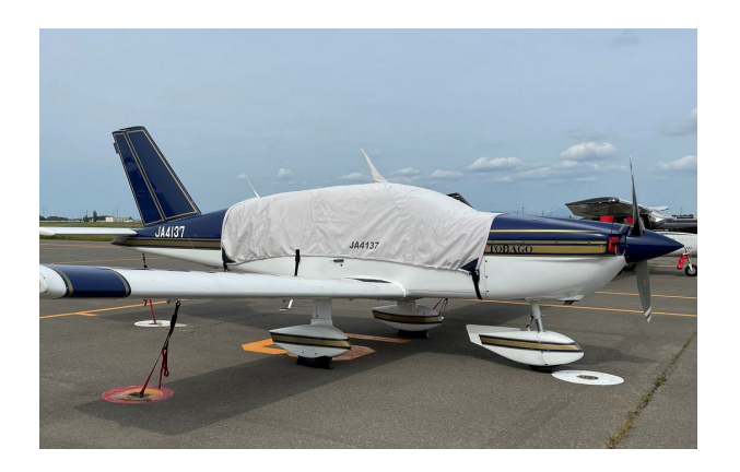
Socata TB10 Canopy Cover, Engine Plugs