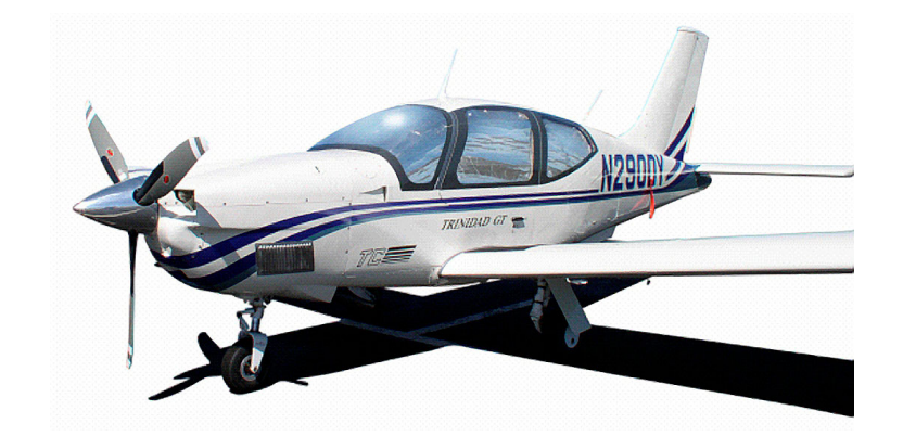
Socata TB20 HeatShields

Windshield Heatshields are interior sunshades for an aircraft's front windshield. The product is a unique composite of closed-cell foam with a silver mylar finish. The semi-rigid design is stiff enough to stand along the inside of the windshield using sun visors or window framing. It folds up flat and easily stores in the included storage sleeve. Some designs may require velcro and suction cups or split right and left sides. A Heatshield is an excellent short-term remedy for cockpit overheating. An external fabric cover is far more effective and practical for long-term protection.