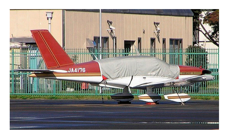
Socata TB-10 Tampico Canopy Cover