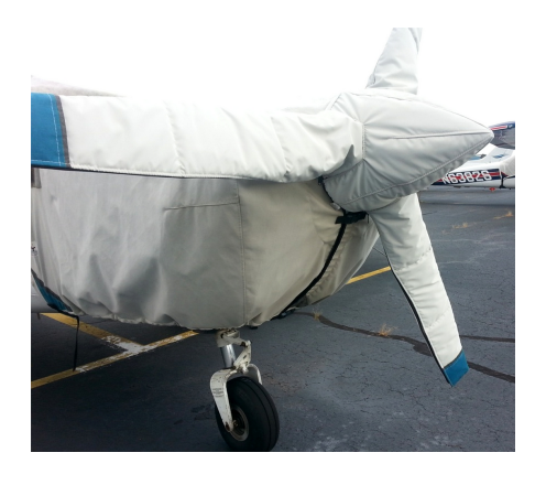
Socata Trinidad/Tobago Engine & Prop Covers