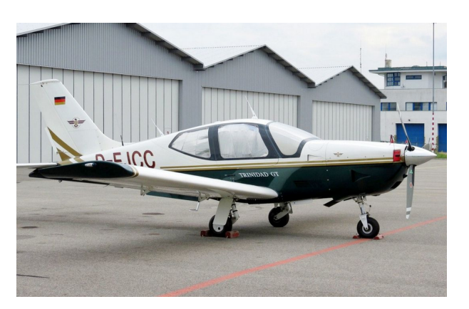
Socata Tobago TB20 Heatshields