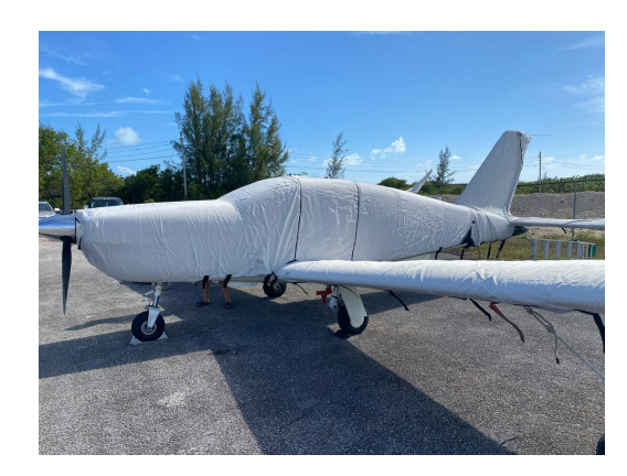
Socata TB-20 Trinidad Complete Cover Set

WINTER USE MATERIAL - Made with Solution-Dyed Polyester fabric, this option is intended for seasonal use to aid in deicing, rain mitigation, or for occasional travel. The material is lighter and more compact, but more susceptible to UV damage and may have a shorter useful life if used continuously outside than the all-year use material.