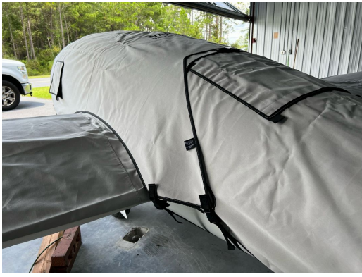
Pipistrel Taurus Complete Cover Set