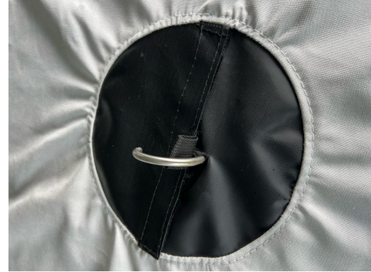
Pipistrel Taurus Complete Cover Set