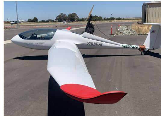
Pipistrel Taurus & Electro Wingtip Pads