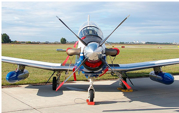
Texan II T6A Engine Inlet Plug, Prop Tie/Exhaust Covers

This cover type is made from Silver Acrylic Sunbrella canvas and is 100% lined with a soft and smooth microfiber. Bruce's Custom Covers developed this material combination especially for aircraft protection. The outer material is medium weight and treated for water resistance, UV resistance and anti-static buildup. The inner lining is a very soft and smooth microfiber to prevent scratching. The material is very reflective, and tests show that the cabin interior temperature can be reduced to near-ambient temperature on the hottest of days. It is water, ice and snow repellent, yet breathable to allow moisture to escape from between the cover and the aircraft surface.