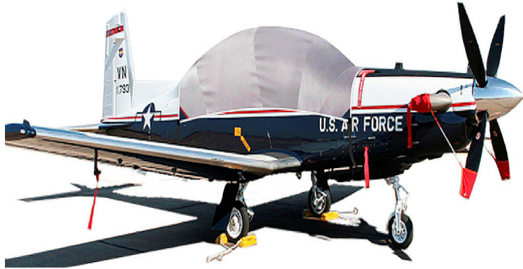
Texan II T6A Canopy Cover, Engine Inlet Plug, Prop Tie/Exhaust Covers, Pitot Cover

This cover type is made from Silver Acrylic Sunbrella canvas and is 100% lined with a soft and smooth microfiber. Bruce's Custom Covers developed this material combination especially for aircraft protection. The outer material is medium weight and treated for water resistance, UV resistance and anti-static buildup. The inner lining is a very soft and smooth microfiber to prevent scratching. The material is very reflective, and tests show that the cabin interior temperature can be reduced to near-ambient temperature on the hottest of days. It is water, ice and snow repellent, yet breathable to allow moisture to escape from between the cover and the aircraft surface.