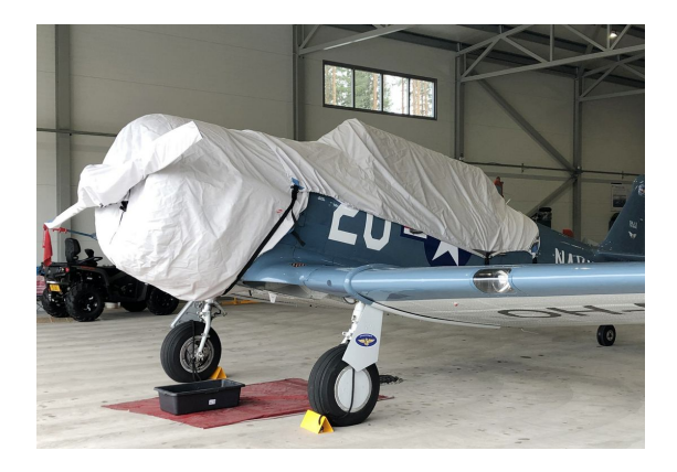
North American T6 Prop, Engine, & Canopy Covers

This cover type is made from Silver Acrylic Sunbrella canvas and is 100% lined with a soft and smooth microfiber. Bruce's Custom Covers developed this material combination especially for aircraft protection. The outer material is medium weight and treated for water resistance, UV resistance and anti-static buildup. The inner lining is a very soft and smooth microfiber to prevent scratching. The material is very reflective, and tests show that the cabin interior temperature can be reduced to near-ambient temperature on the hottest of days. It is water, ice and snow repellent, yet breathable to allow moisture to escape from between the cover and the aircraft surface.