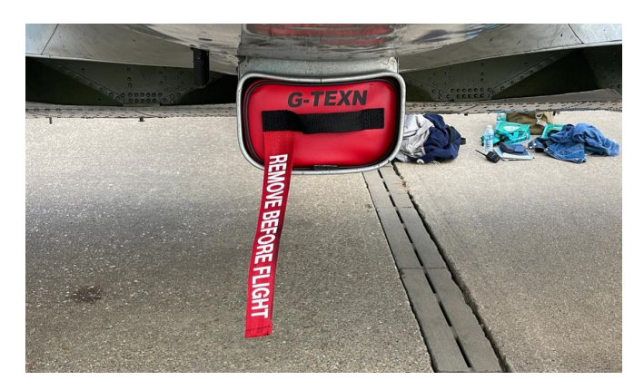
T6 Harvard Chin Scoop Plug

Engine Inlet Plugs are custom fit for your North American T6, SNJ, Harvard intakes, made with heavy-duty vinyl material, and stuffed with a single block of sculpted urethane foam. Each plug has a zipper that allows the foam to be removed and dried if necessary. Engine plugs have warning flags that are visible from the cockpit or 'remove before flight' streamers sewn onto the face of the plugs. Most plugs are imprinted with the aircraft registration number in black for an extra charge. Storage bag NOT included. Engine plugs may be inserted after flight when the engine is still warm. Engine Inlet Plugs are commonly referred to as Cowl Plugs, Intake Plugs, Cowl Blocks, Engine Blocks, and Engine Bungs.