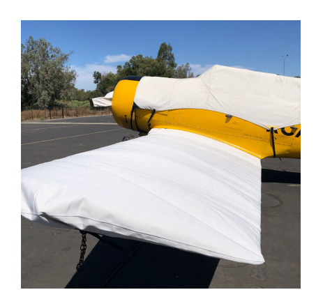
North American T6, SNJ, Harvard Canopy Cover With 48" Fwd Ext