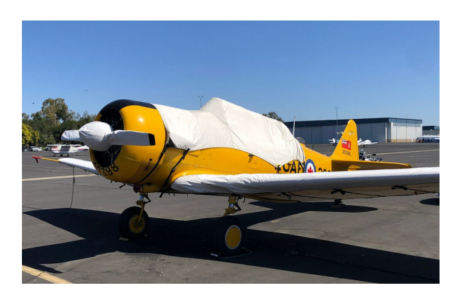
North American Harvard T6 Canopy, Prop & Wing Covers

WINTER USE MATERIAL - Made with Solution-Dyed Polyester fabric, this option is intended for seasonal use to aid in deicing, rain mitigation, or for occasional travel. The material is lighter and more compact, but more susceptible to UV damage and may have a shorter useful life if used continuously outside than the all-year use material.