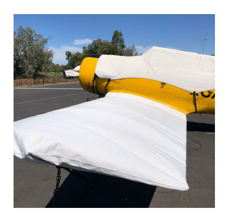
North American Harvard T6 Canopy, Prop & Wing Covers