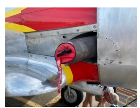
North American T6 Chin Exhaust Plug