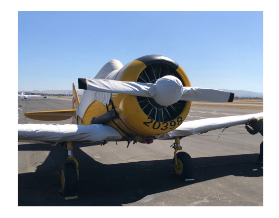
North American Harvard T6 Canopy, Prop & Wing Covers