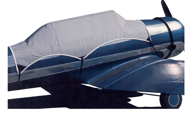
North American T6, SNJ, Harvard Canopy Cover With 48" Fwd Ext