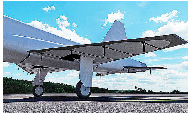
T-38 Talon Wing and Horizontal Stabilizer Covers (3D Rendering)