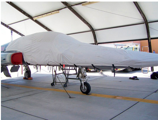
Northup F5 Talon Canopy Cover

Travel Covers are made with Silver Solution-Dyed Polyester fabric and only lined over the windshield to save weight. The material is lightweight and more compact for easy stowage in the aircraft. The polyester material is water resistant, but only intended for occasional use outside. We also have an ultra lightweight material available for fitted hangar dust covers. For daily outdoor use, the non-travel Sunbrella Cover is the best choice.