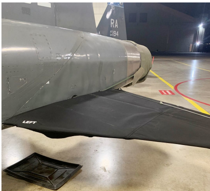
Northrop T-38 Horizontal Stabilizer Cover

WINTER USE MATERIAL - Made with Solution-Dyed Polyester fabric, this option is intended for seasonal use to aid in deicing, rain mitigation, or for occasional travel. The material is lighter and more compact, but more susceptible to UV damage and may have a shorter useful life if used continuously outside than the all-year use material.