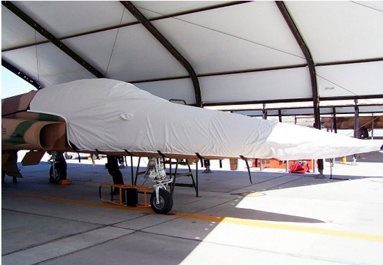
Northup F-5 Talon Canopy/Nose Cover

This cover type is made from Silver Acrylic Sunbrella canvas and is 100% lined with a soft and smooth microfiber. Bruce's Custom Covers developed this material combination especially for aircraft protection. The outer material is medium weight and treated for water resistance, UV resistance and anti-static buildup. The inner lining is a very soft and smooth microfiber to prevent scratching. The material is very reflective, and tests show that the cabin interior temperature can be reduced to near-ambient temperature on the hottest of days. It is water, ice and snow repellent, yet breathable to allow moisture to escape from between the cover and the aircraft surface.