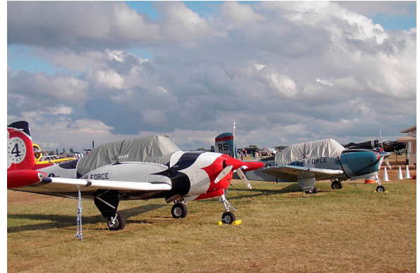
T34 Canopy Covers and Engine Inlet Plugs