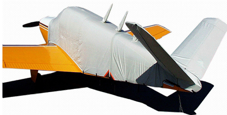
Extended Canopy Cover & Empennage Cover