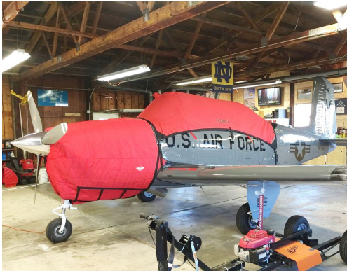
Beech T34 Mentor Canopy Cover, Insulated Engine Cover

This cover type is made from Silver Acrylic Sunbrella canvas and is 100% lined with a soft and smooth microfiber. Bruce's Custom Covers developed this material combination especially for aircraft protection. The outer material is medium weight and treated for water resistance, UV resistance and anti-static buildup. The inner lining is a very soft and smooth microfiber to prevent scratching. The material is very reflective, and tests show that the cabin interior temperature can be reduced to near-ambient temperature on the hottest of days. It is water, ice and snow repellent, yet breathable to allow moisture to escape from between the cover and the aircraft surface.