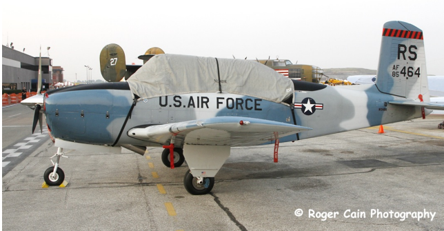
Beech T34 Canopy Cover

This cover type is made from Silver Acrylic Sunbrella canvas and is 100% lined with a soft and smooth microfiber. Bruce's Custom Covers developed this material combination especially for aircraft protection. The outer material is medium weight and treated for water resistance, UV resistance and anti-static buildup. The inner lining is a very soft and smooth microfiber to prevent scratching. The material is very reflective, and tests show that the cabin interior temperature can be reduced to near-ambient temperature on the hottest of days. It is water, ice and snow repellent, yet breathable to allow moisture to escape from between the cover and the aircraft surface.