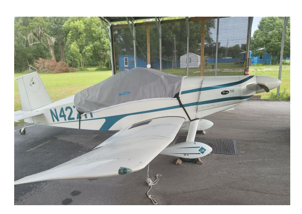
Thorp T-18 Travel Cover

Travel Covers are made with Silver Solution-Dyed Polyester fabric and only lined over the windshield to save weight. The material is lightweight and more compact for easy stowage in the aircraft. The polyester material is water resistant, but only intended for occasional use outside. We also have an ultra lightweight material available for fitted hangar dust covers. For daily outdoor use, the non-travel Sunbrella Cover is the best choice.