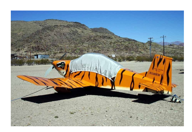
Thorp T-18 Canopy Cover