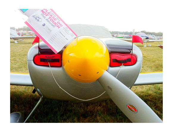
Vans's RV-7 Engine Engine Inlet Plugs