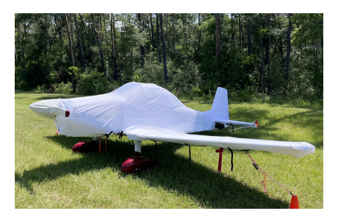
Thorp T-18 & Bushby Mustang Complete Cover, test fit cover