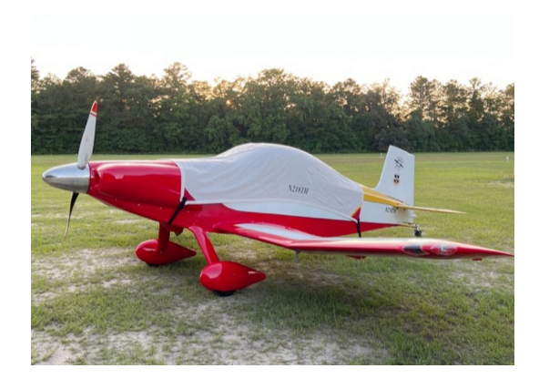
Thorp T-18 Canopy Cover

This cover type is made from Silver Acrylic Sunbrella canvas and is 100% lined with a soft and smooth microfiber. Bruce's Custom Covers developed this material combination especially for aircraft protection. The outer material is medium weight and treated for water resistance, UV resistance and anti-static buildup. The inner lining is a very soft and smooth microfiber to prevent scratching. The material is very reflective, and tests show that the cabin interior temperature can be reduced to near-ambient temperature on the hottest of days. It is water, ice and snow repellent, yet breathable to allow moisture to escape from between the cover and the aircraft surface.