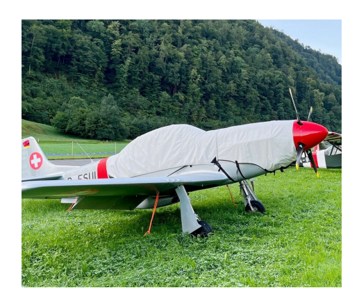
Stewart S-51 Canopy & Engine Covers

This cover type is made from Silver Acrylic Sunbrella canvas and is 100% lined with a soft and smooth microfiber. Bruce's Custom Covers developed this material combination especially for aircraft protection. The outer material is medium weight and treated for water resistance, UV resistance and anti-static buildup. The inner lining is a very soft and smooth microfiber to prevent scratching. The material is very reflective, and tests show that the cabin interior temperature can be reduced to near-ambient temperature on the hottest of days. It is water, ice and snow repellent, yet breathable to allow moisture to escape from between the cover and the aircraft surface.