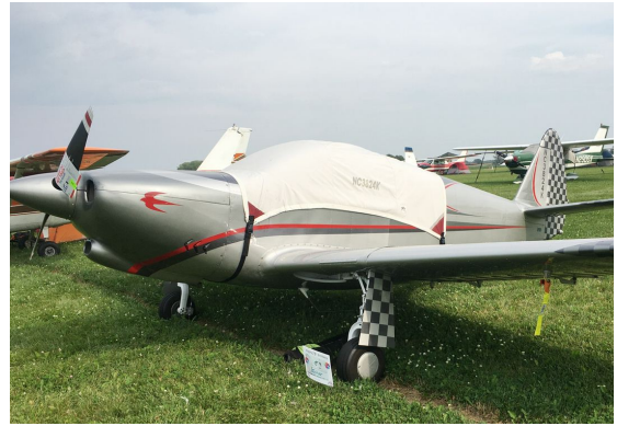
Globe Swift Canopy Cover