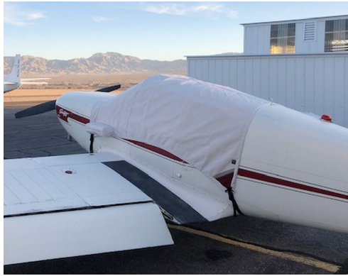
Globe-Temco Swift Canopy Cover, standard type

This cover type is made from Silver Acrylic Sunbrella canvas and is 100% lined with a soft and smooth microfiber. Bruce's Custom Covers developed this material combination especially for aircraft protection. The outer material is medium weight and treated for water resistance, UV resistance and anti-static buildup. The inner lining is a very soft and smooth microfiber to prevent scratching. The material is very reflective, and tests show that the cabin interior temperature can be reduced to near-ambient temperature on the hottest of days. It is water, ice and snow repellent, yet breathable to allow moisture to escape from between the cover and the aircraft surface.