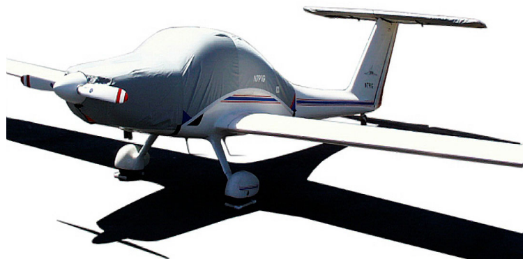
Grob 109 Canopy/Engine Cover & Horiz. Stabilizer Cover