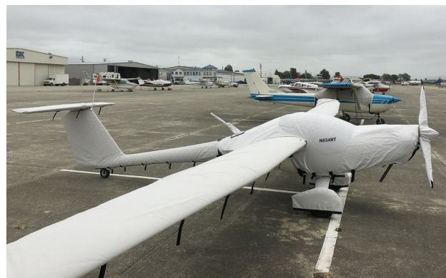
Lambda Canopy/Engine Cover and Wing Covers Distar Sundancer LSA Extended Canopy/Engine, Prop, Wheelpants, Wings & Empennage Covers