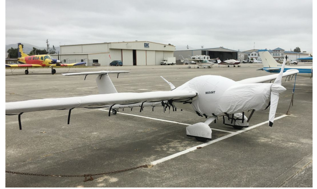
Distar Sundancer LSA Extended Canopy/Engine, Prop, Wheelpant, Wings & Empennage Covers