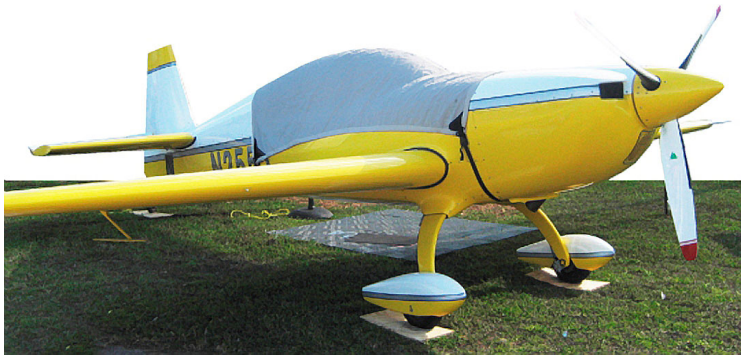
Extra 300/L Canopy Cover