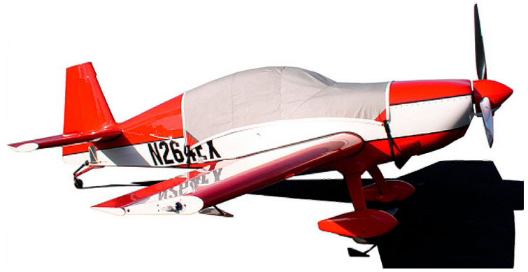
Canopy Cover for the Extra 300