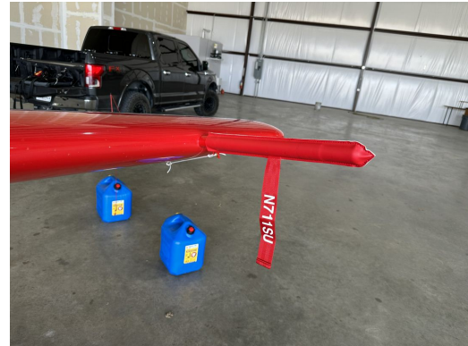
Sukhoi SU-26 Pitot Cover