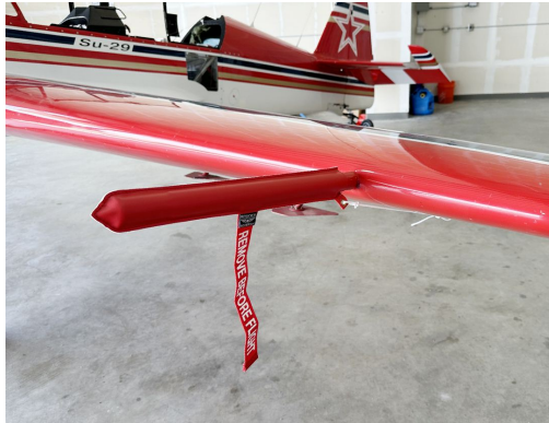
Sukhoi SU-26 Pitot Cover

Sukhoi SU-26 Pitot Tube Covers , NOT HEAT RESISTANT TYPE, are made of Naugahyde vinyl, and are designed to cover the entire pitot assembly. Slipping over the tube, the cover tightens around the base with a Velcro strap detail. A "Remove Before Flight" streamer is attached to the cover. Heat Resistant Pitot Covers are an upgrade to this design, and help prevent the pitot cover from melting onto the tube if the pitot heat is accidentally turned on while installed. If you want the set tethered together, please let us know.