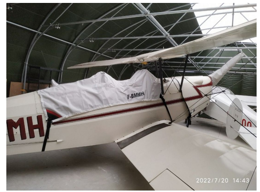
Stampe SV-4 Canopy Cover