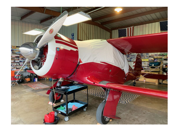
Beech Staggerwing D17S Canopy Cover