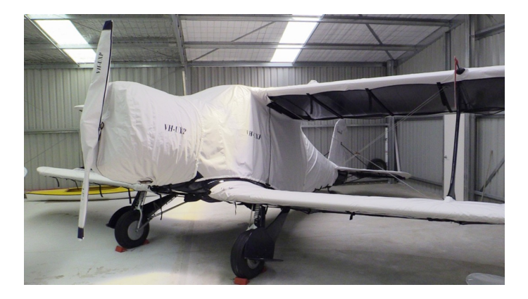
Beech Staggerwing Complete Cover Set