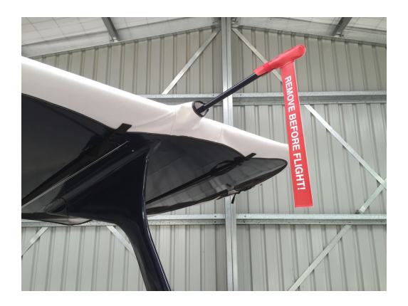
Beech Staggerwing Complete Cover Set, Upper Wing Detail