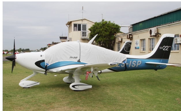
Cirrus SR-22 Canopy Cover