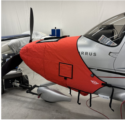
Cirrus SR-22 Insulated Engine Cover