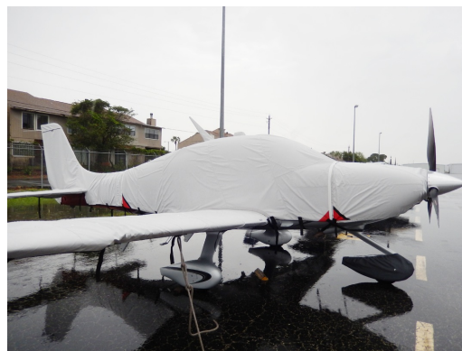
Cirrus SR-22 Complete Cover Set