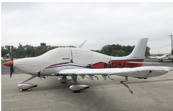
Cirrus SR-22 Canopy/Engine & Wing Covers

WINTER USE MATERIAL - Made with Solution-Dyed Polyester fabric, this option is intended for seasonal use to aid in deicing, rain mitigation, or for occasional travel. The material is lighter and more compact, but more susceptible to UV damage and may have a shorter useful life if used continuously outside than the all-year use material.