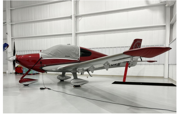
Cirrus SR-22 Cockpit Cover