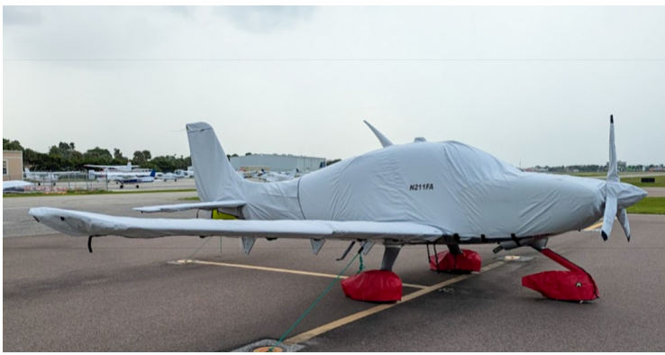
Cirrus SR-20 Complete Cover Set