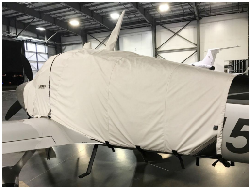
Cirrus SR-22 Extended Canopy Cover

This cover type is made from Silver Acrylic Sunbrella canvas and is 100% lined with a soft and smooth microfiber. Bruce's Custom Covers developed this material combination especially for aircraft protection. The outer material is medium weight and treated for water resistance, UV resistance and anti-static buildup. The inner lining is a very soft and smooth microfiber to prevent scratching. The material is very reflective, and tests show that the cabin interior temperature can be reduced to near-ambient temperature on the hottest of days. It is water, ice and snow repellent, yet breathable to allow moisture to escape from between the cover and the aircraft surface.