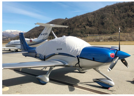
Cirrus SR-22 Canopy Cover (extends to cover parachute panel), Engine Plugs