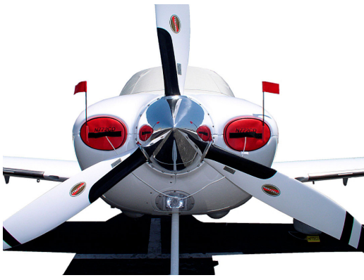
Cirrus SR22 Engine Plugs