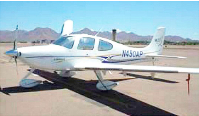
Cirrus SR20 HeatShield set

Windshield Heatshields are interior sunshades for an aircraft's front windshield. The product is a unique composite of closed-cell foam with a silver mylar finish. The semi-rigid design is stiff enough to stand along the inside of the windshield using sun visors or window framing. It folds up flat and easily stores in the included storage sleeve. Some designs may require velcro and suction cups or split right and left sides. A Heatshield is an excellent short-term remedy for cockpit overheating. An external fabric cover is far more effective and practical for long-term protection.