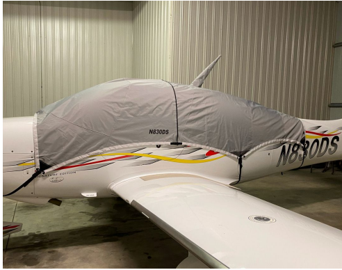
Cirrus SR-22 Travel Weight Canopy Cover

non-travel Sunbrella Cover is the best choice.