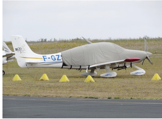
Cirrus SR-22 Extended Canopy/Engine Cover, Prop Cover, Wingtip Pads