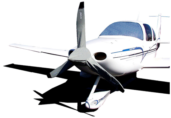
Cirrus SR-22 Propellor/Spinner Cover & Windshield Heatshield