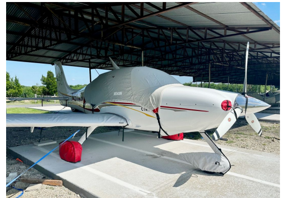
Cirrus SR-22 Wheelpant Covers