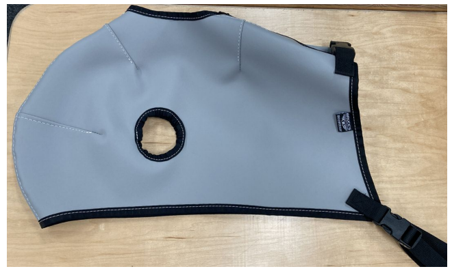
Cirrus SR-22 Wheelpant Cover